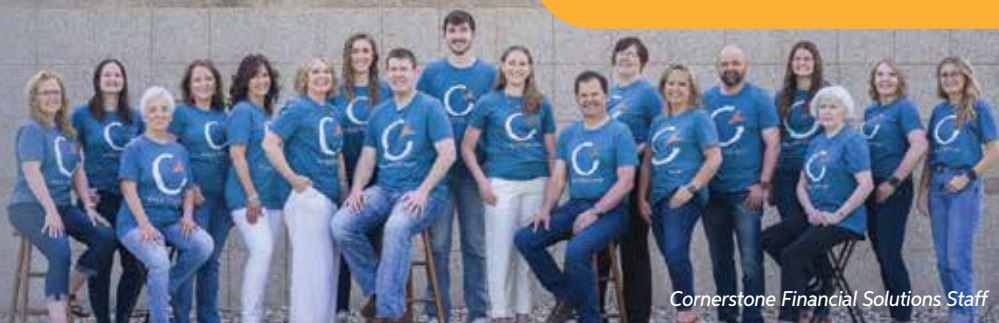
Cornerstone Financial Solutions Staff