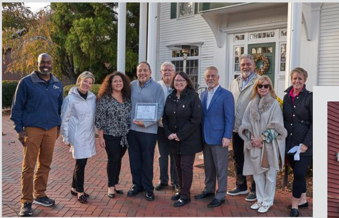
Cafe Allegre Celebrating 30 Years