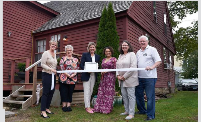
Tea & Tarot Ribbon Cutting