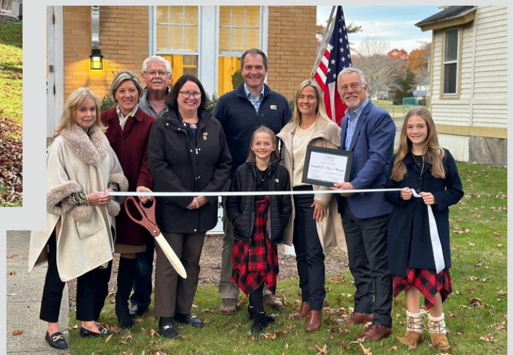
Coastal KIDS Physical Therapy Ribbon Cutting