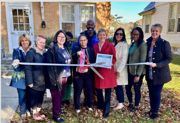
628 Digital Design Ribbon Cutting