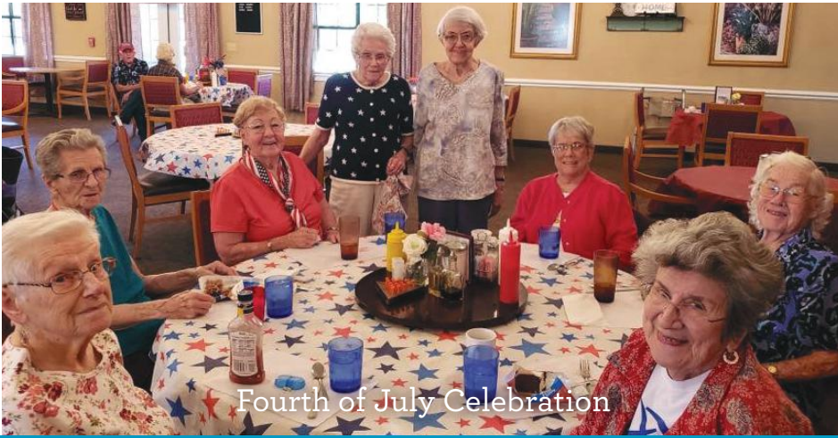
Fourth of July Celebration