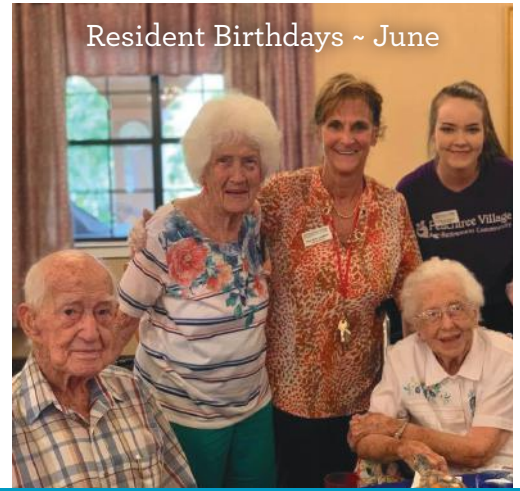
Resident Birthdays ~ June