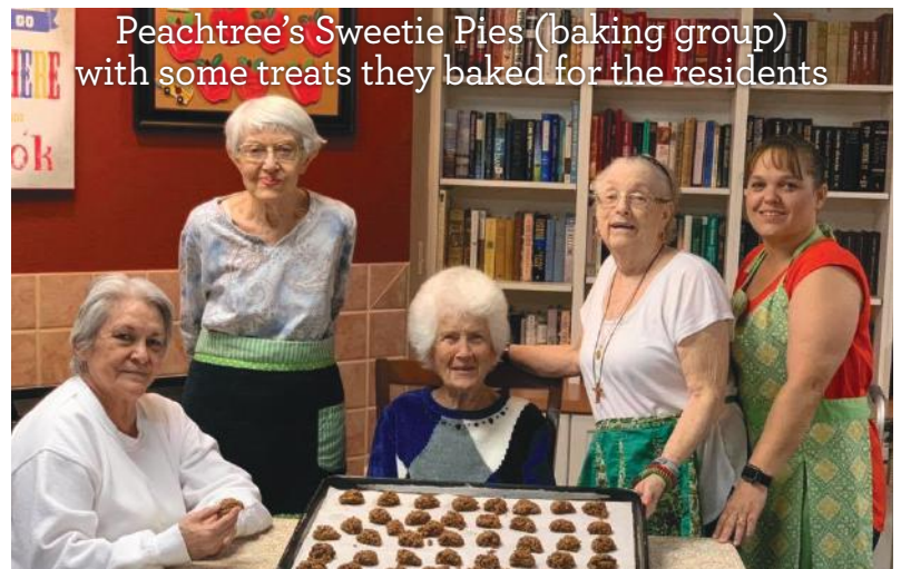
Peachtree's Sweetie Pies (baking group) with some treats they baked for the residents