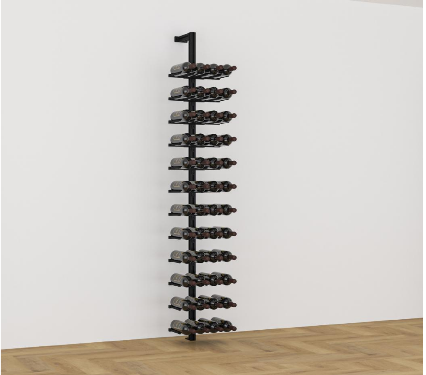
Multi-bottle (neck out).