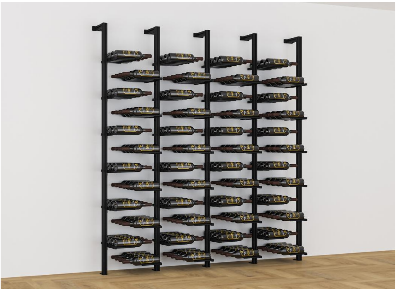
Multi-bottle offset 4