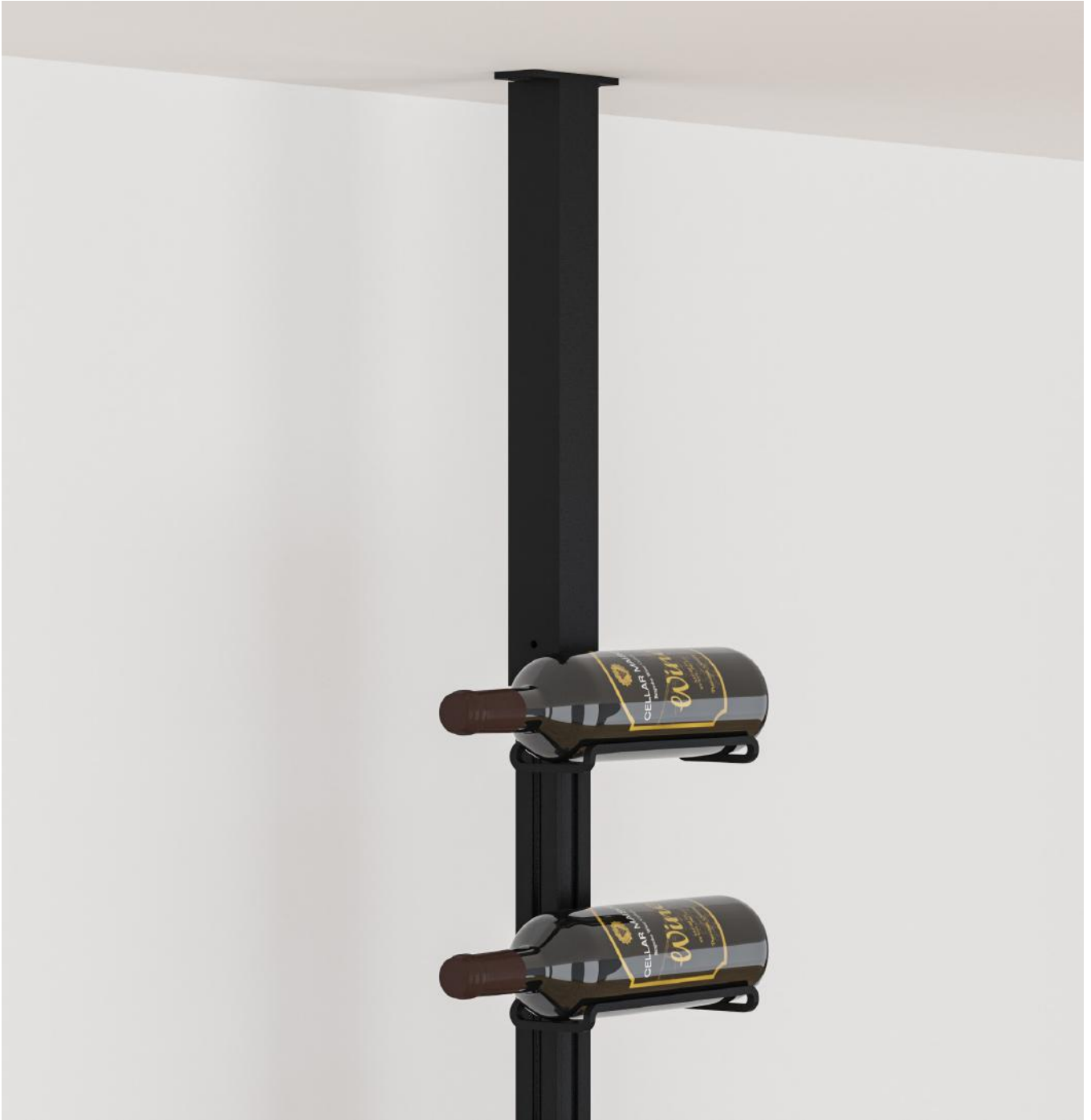
Ceiling Mounted Fixing Option.