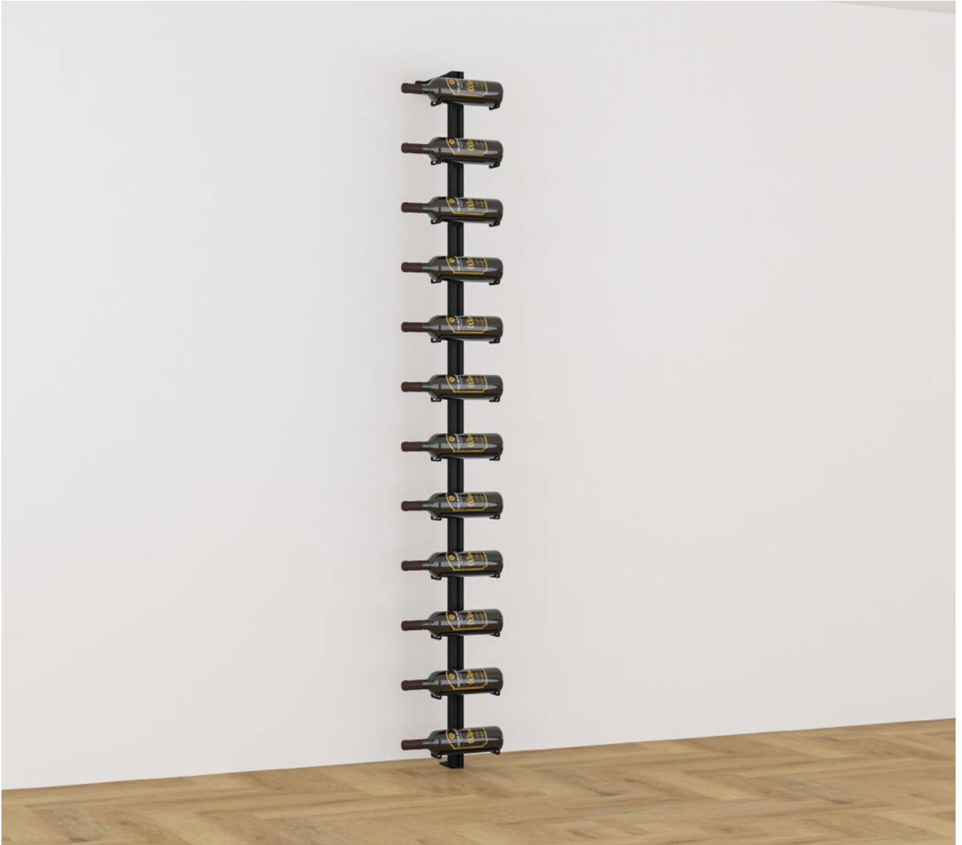
Cradle (single bottle depth).