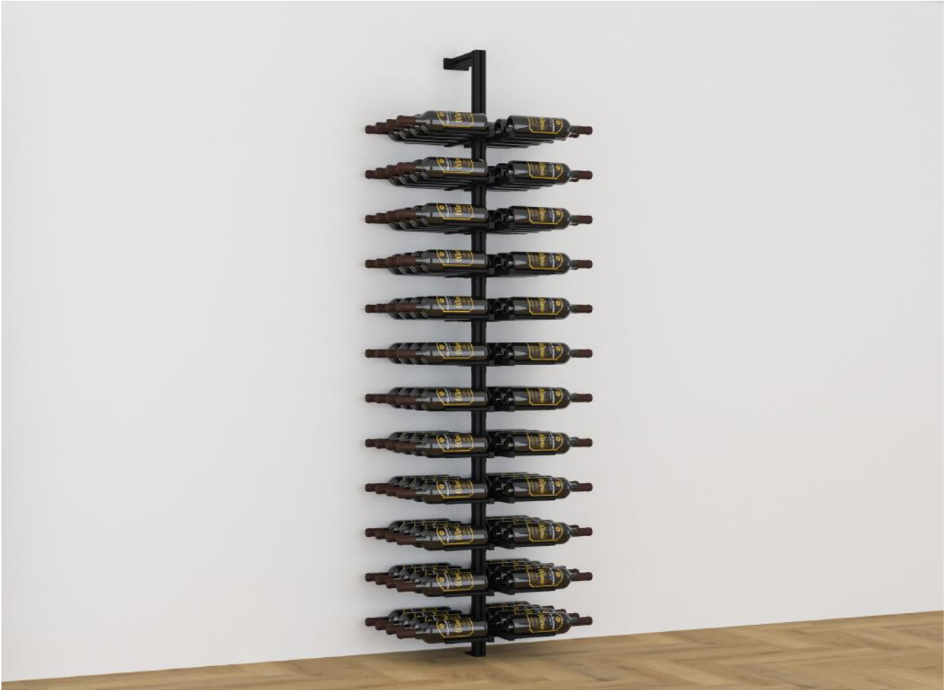
Multi-bottle straight (label-out)