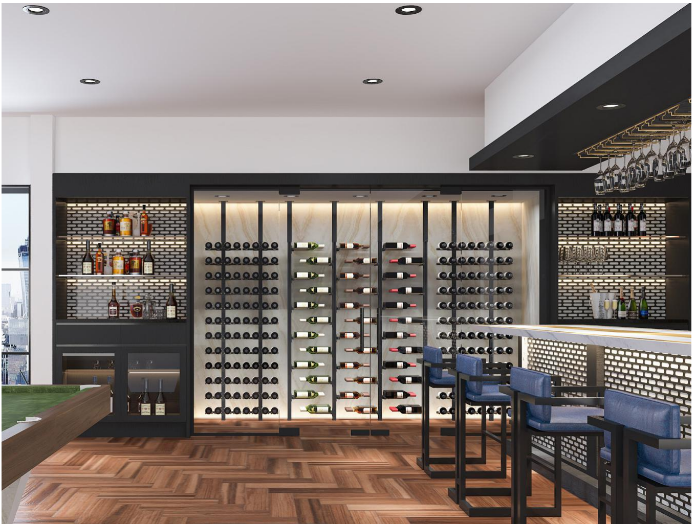
Contemporary Living Space - Display Series

Shelving used: Multi-bottle / neck Multi-bottle / offset