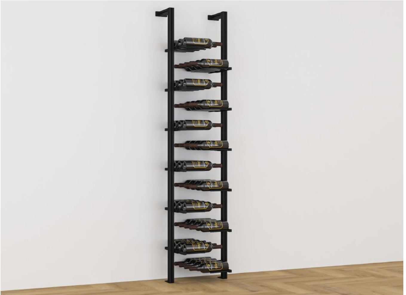
Multi-bottle offset 1