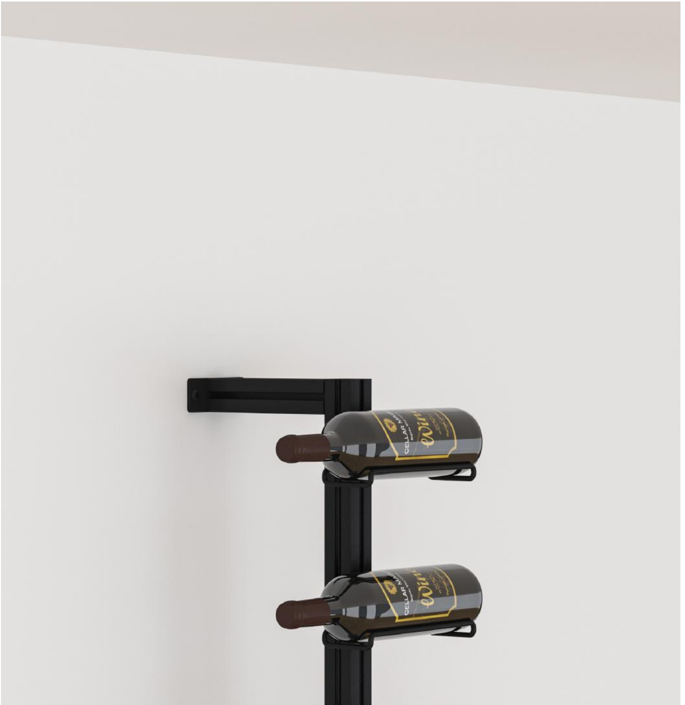
Wall Mounted Fixing Option.