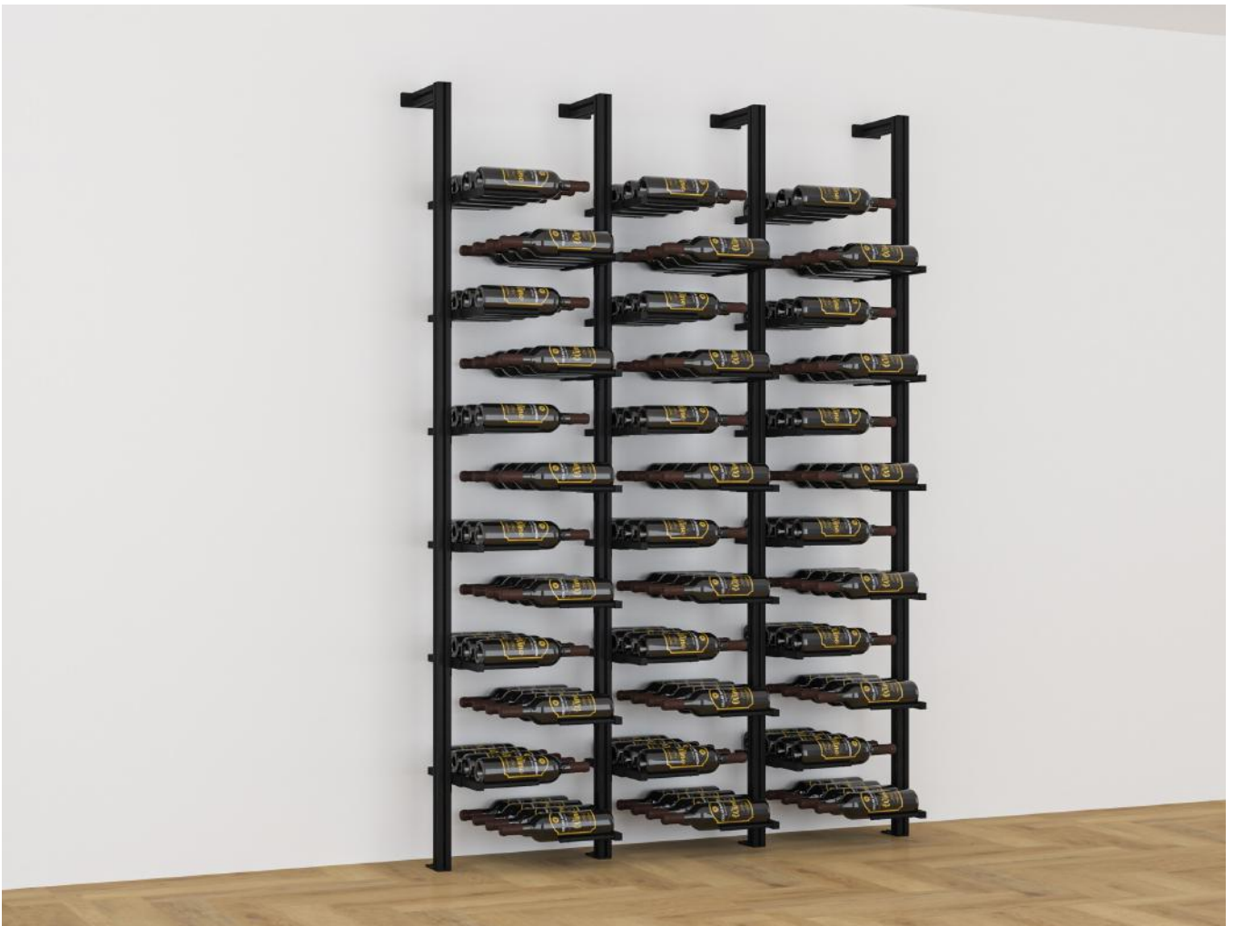
Multi-bottle offset 3