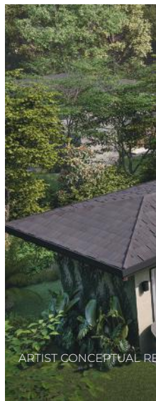
ARTIST CONCEPTUAL RE