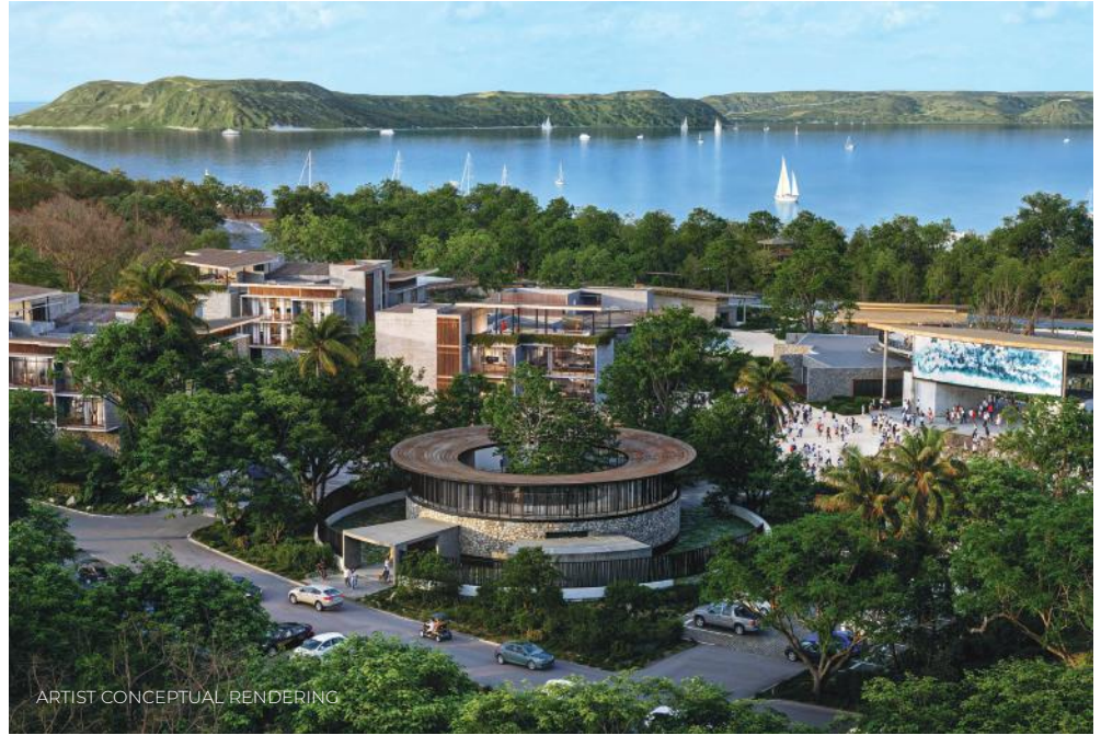
ARTIST CONCEPTUAL RENDERING