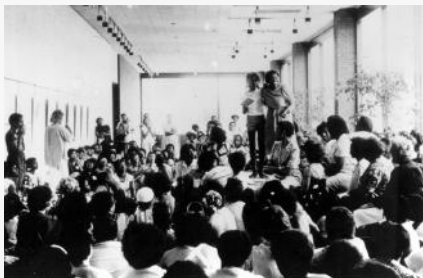
1983 BLACK & FEMALE: WHAT IS THE REALITY WORKSHOP