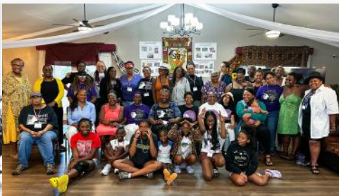
2023 BLACK & FEMALE RETREAT PARTICIPANTS