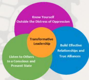
The Be Present Empowerment Model®