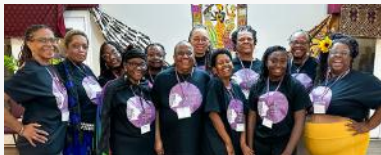
2023 BLACK & FEMALE LEADERSHIP TEAM

Our Leadership work addresses both the lack and, too often, the distortion of the voices and visibility of Black women's leadership in the literature, historical record and dialogue on social justice movement-building. It also highlights the process, as well as the achievements of using a collective leadership approach in creating a diverse national network of activists successfully moving social justice agendas in the U.S.