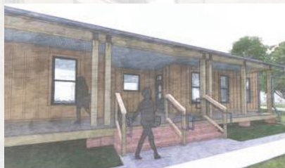
New Classroom Building