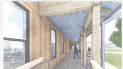
New Classroom Building - Porch View