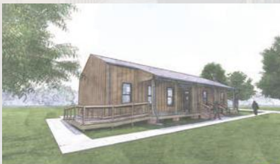
New Classroom Building