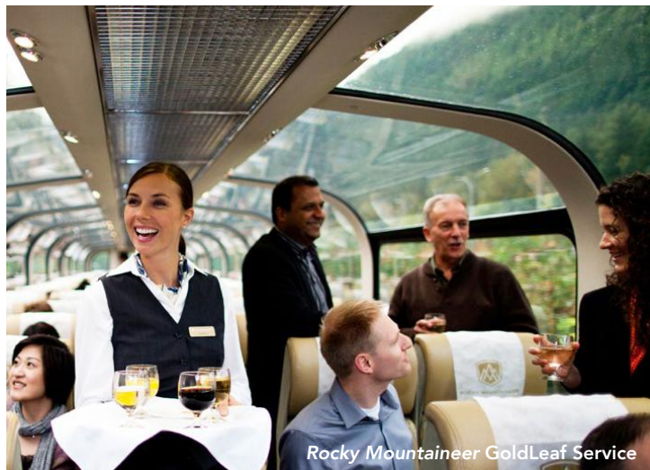
Rocky Mountaineer GoldLeaf Service