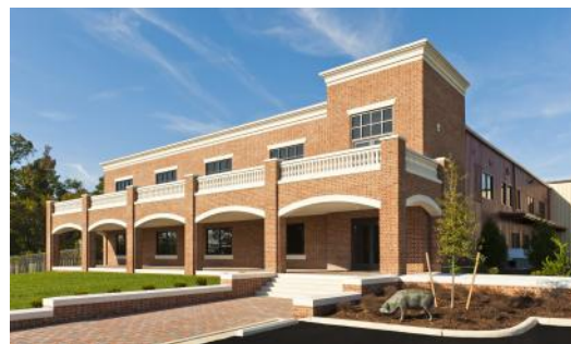
Smithfield Innovation Center

Smithfield Foods is a $12 billion global food company and the world's largest pork processor and hog producer. In the United States, the company is also the leader in numerous packaged meats categories with popular brands including Farmland, ® Smithfield, ® Eckrich, ® Armour, ® and John Morrell. ®