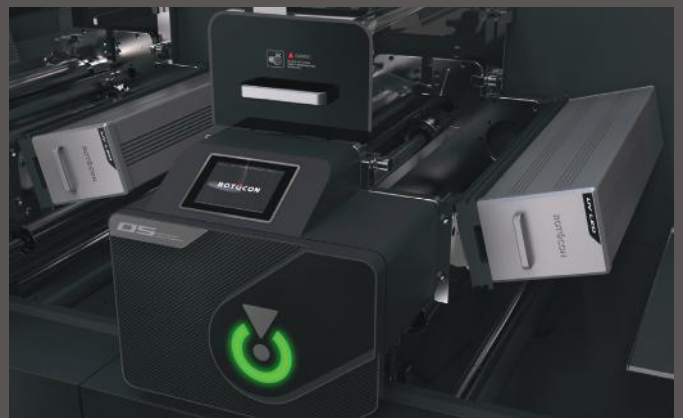
Cylinder system with two servo motors