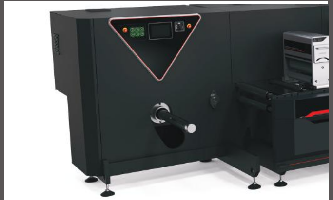
Unwind Unit/ Roll Lift