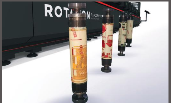
Printing Cylinder with Gear