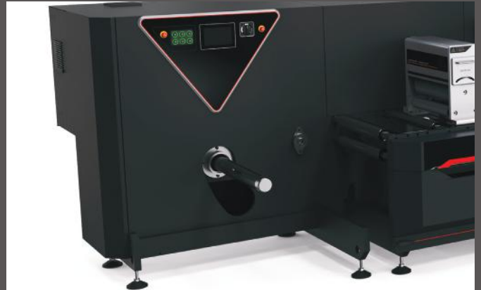
Unwind Unit/ Web Guiding