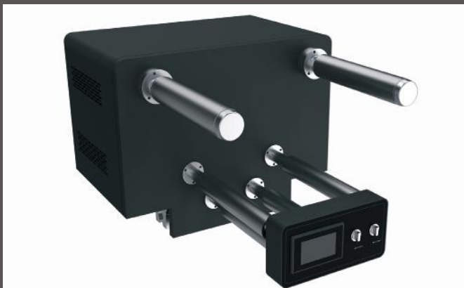
Cold Foil / Register Lamination

Servo-driven technology ensures accurate ink distribution, helping maintain consistent print quality while reducing ink waste