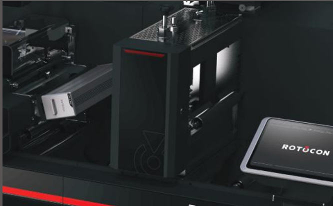
Die Cutting / Matrix Removal