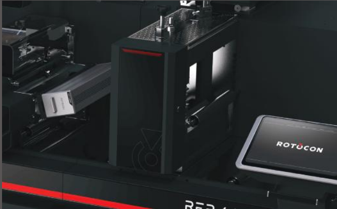
Die Cutting / Matrix Removal

RFP S-SERIES FLEXO PRESS 350S • 450S • 530S • 660S