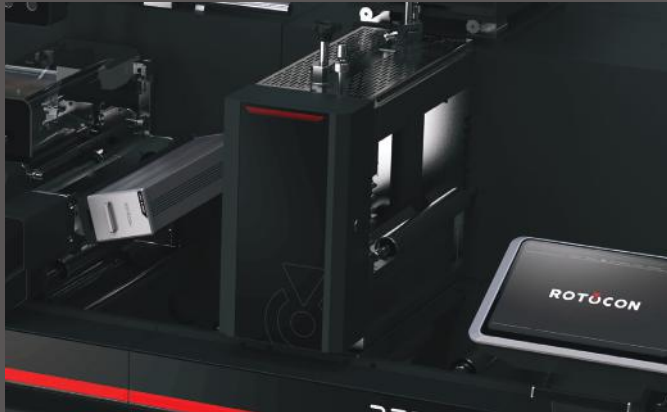
Die Cutting / Matrix Removal

RFP C-SERIES FLEXO PRESS 350C • 450C • 530C • 660C