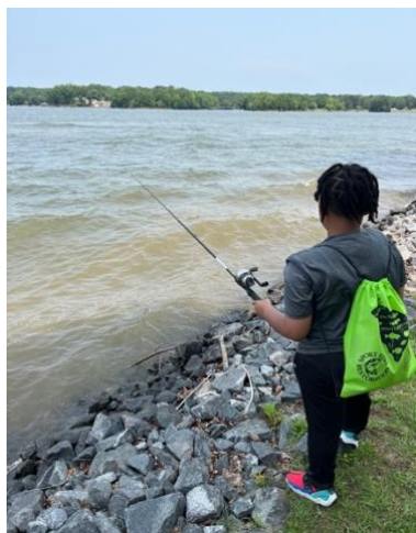
Fishing is one of several activities at the Children's Outing.

Although the water temperature was a bit chilly (74 degrees), it didn't seem to deter a lot of them from getting in and splashing about.