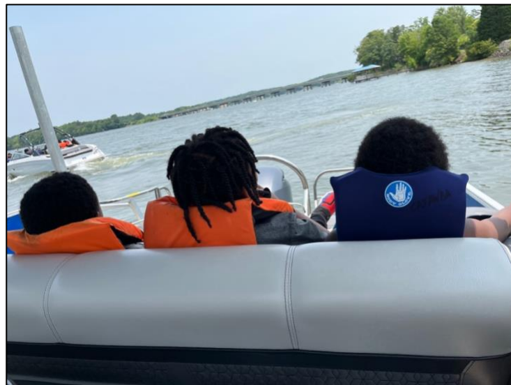
More than 300 children, family members and sponsors participated.