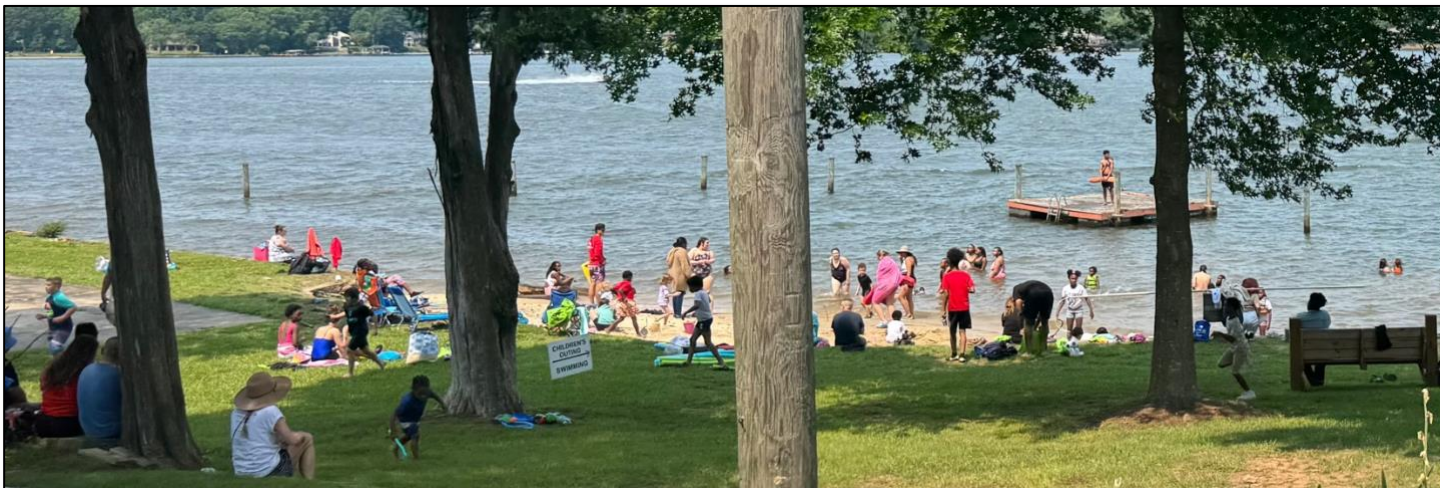
The chilly weather didn't stop the kids and others from enjoying Lake Wylie at the 2025 Children's Outing.