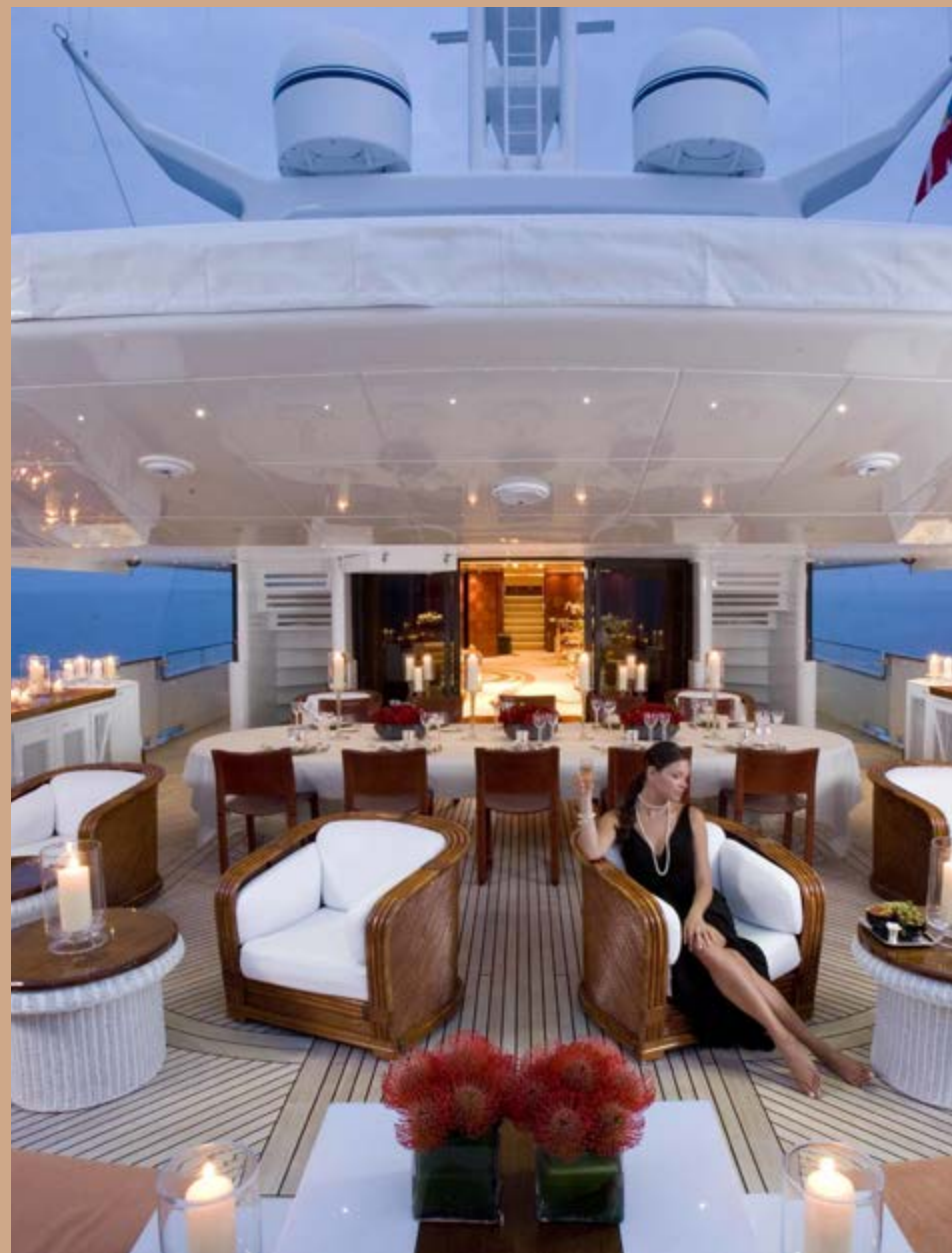
M/Y BAD GIRL (EX CHAMAR)