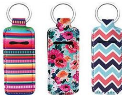
Full Color, double sided Imprint