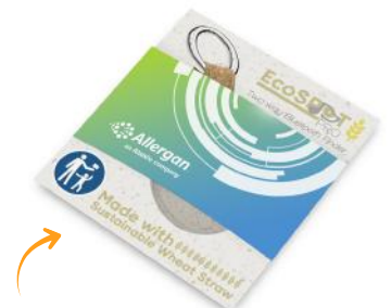
Add a Full-color custom sleeve