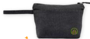
Mini Wristlet Starting at $7 - US only