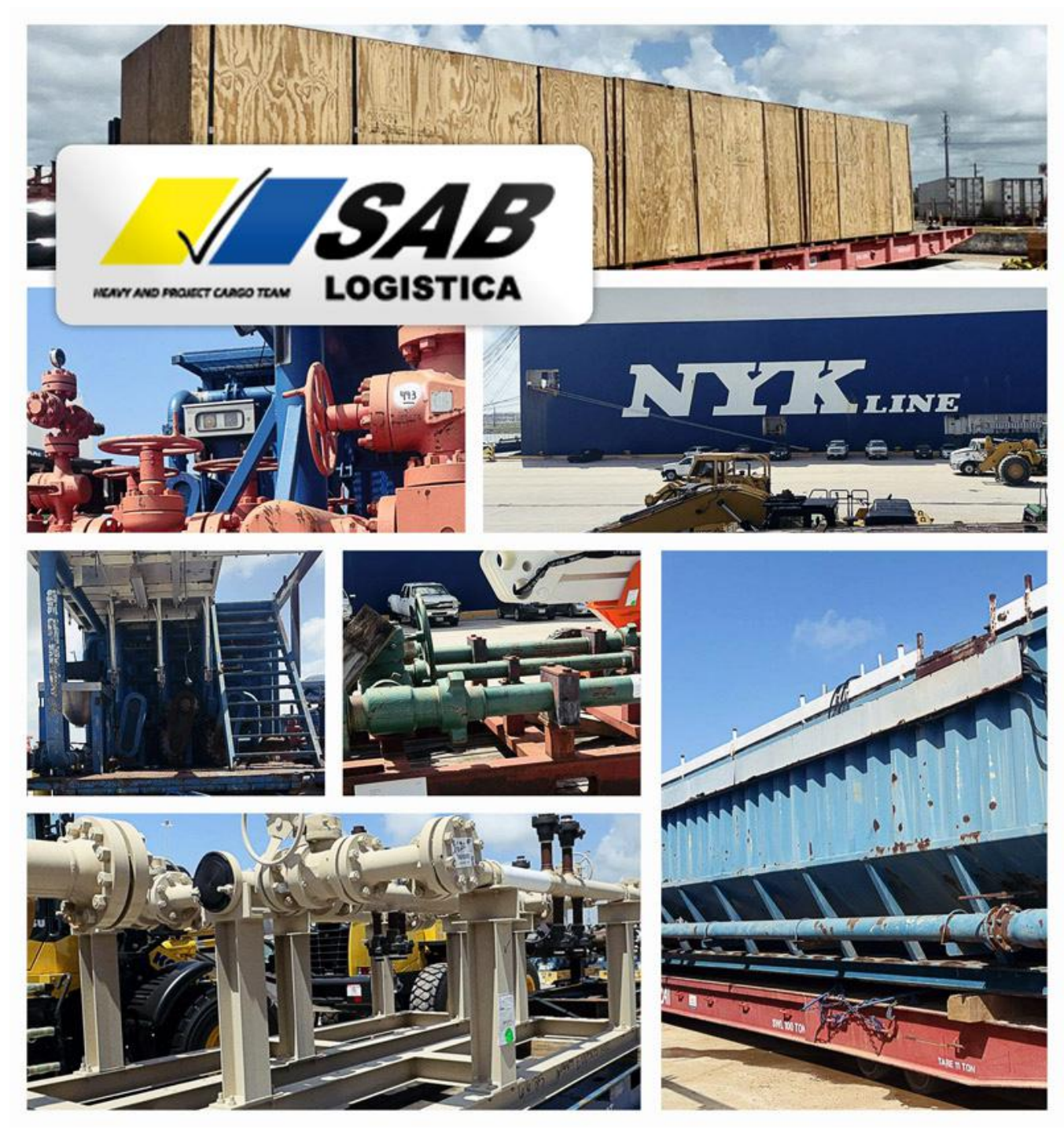
SAB Logistica is a member of CLC Projects representing Argentina