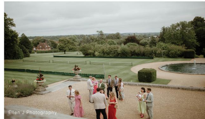
Ellen J Photography