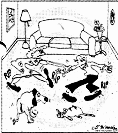
The corporate merger of Plushy's Carpeting and Sticky's Velcro was not a success.