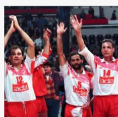
3rd Pos. Champions Cup 1992/93