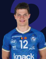
ROTTY Seppe Outside Spiker