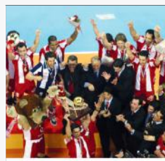
Top Teams Cup Winner 2004/05