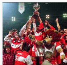
Cup Winners Cup Winner 1995/96