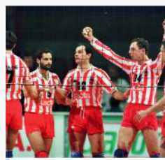
4th Pos. Champions Cup 1993/94