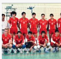
Champions Cup, 2nd on Group A 1988/89