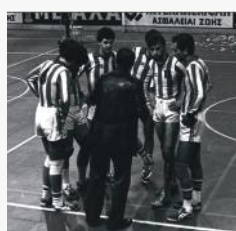
4th Pos. Champions Cup 1981/82