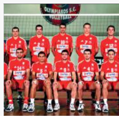
2nd Pos. Champions Cup 2001/02