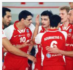
2nd Pos. Cup Winners Cup 1997/98