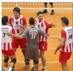
Final-6 Champions League 2009/10