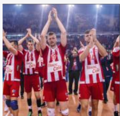
2nd Pos. CEV Challenge Cup 2017/18