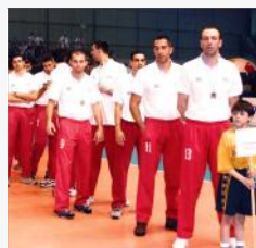
4th Pos. Champions Cup 2000/01