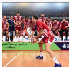
CEV Challenge Cup Winners 2022/23