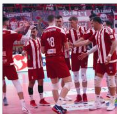
Semifinals CEV Cup 2018/19