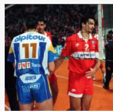
2nd Pos. Cup Winners Cup 1996/97