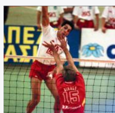
2nd Pos. Champions Cup 1991/92