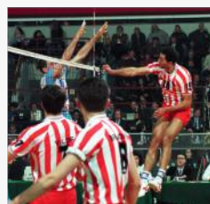
3rd Pos. Champions Cup 1994/95