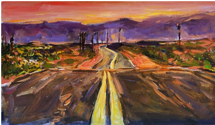
Bob Dylan Endless Highway, 2016 127cm x 95.3cm Giclée £15,000 +GST