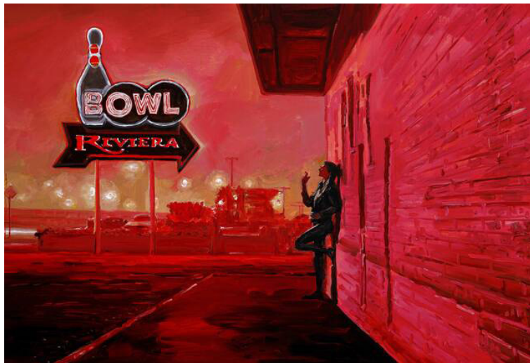
Bob Dylan Down on the Corner Framed size: 35.0in x 29.0in Fine art print £3,900 +GST