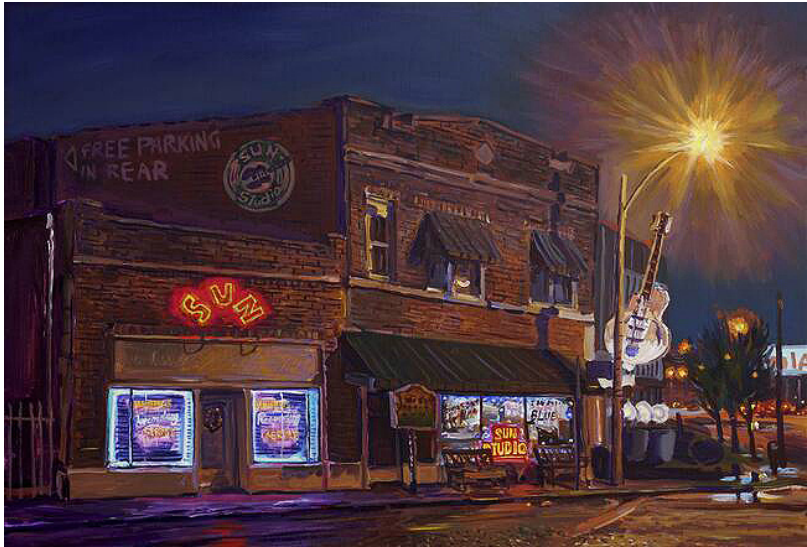
Bob Dylan Recording Studio Framed size: 35.0in x 29.0in Fine art print £3,900 +GST