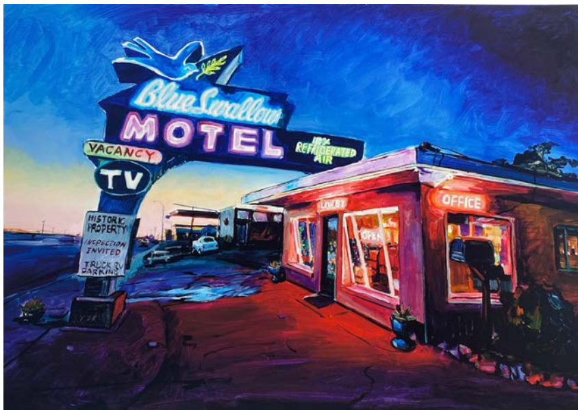
Bob Dylan Blue Swallow Motel, RT 66 , 2019 76cm x 58cm Giclée £5,500 +GST