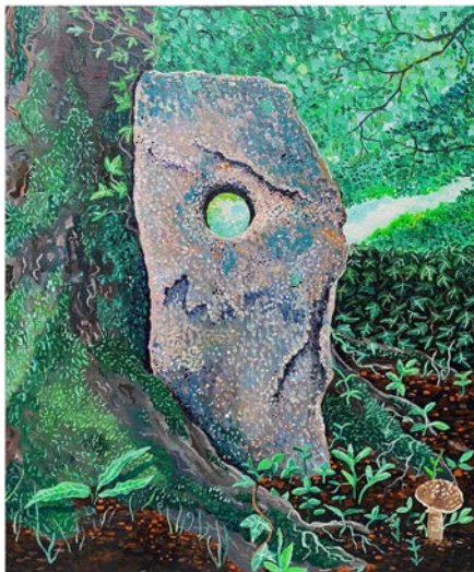
Jacques Le Breton Gate Post Series 4, 2021 51cm x 61cm Acrylic on canvas £1,000 +GST