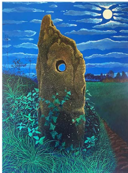
Jacques Le Breton Gate Post Series 7, 2021 51cm x 61cm Acrylic on canvas £1,500 +GST