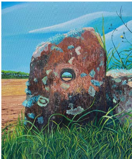
Jacques Le Breton Gate Post Series 2, 2021 51cm x 61cm Acrylic on canvas £1,000 +GST