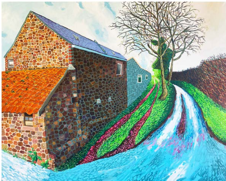
Jacques Le Breton Anneville Farm 120cm x 150cm Acrylic on canvas £3,000 +GST