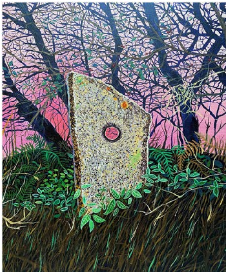
Jacques Le Breton Gate Post Series 6, 2021 51cm x 61cm Acrylic on canvas £1,000 +GST