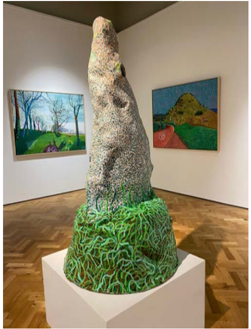
Jacques Le Breton Gatepost, 2022 160cm x 80cm x 80cm Papier Mache £3,000 + GST