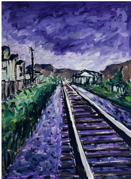
Bob Dylan Train Tracks, 2018 70cm x 56cm Giclée £11,000 +GST