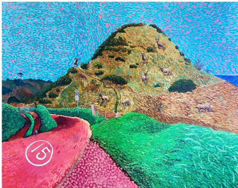
Jacques Le Breton Catel De Lecq, 2022 120cm x 150cm Acrylic on canvas £3,000 +GST