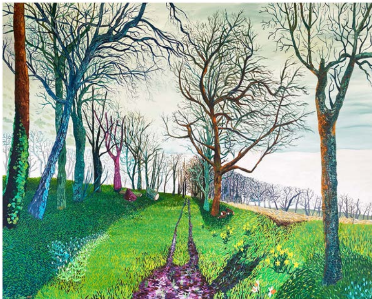
Jacques Le Breton Early Spring, 2022 120cm x 150cm Acrylic on canvas £3,000 +GST