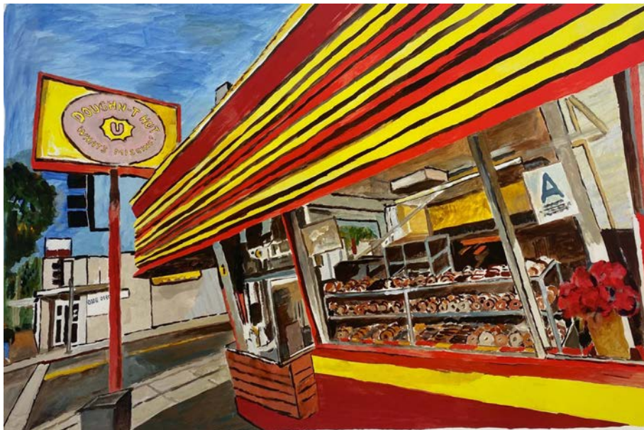
Bob Dylan Donut Shop, 2016 76cm x 58cm Giclée £3,500 +GST