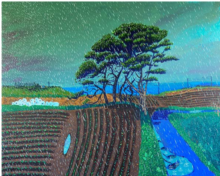
Jacques Le Breton Potato Fields in the Rain 120cm x 150cm Acrylic on canvas £3,000 +GST