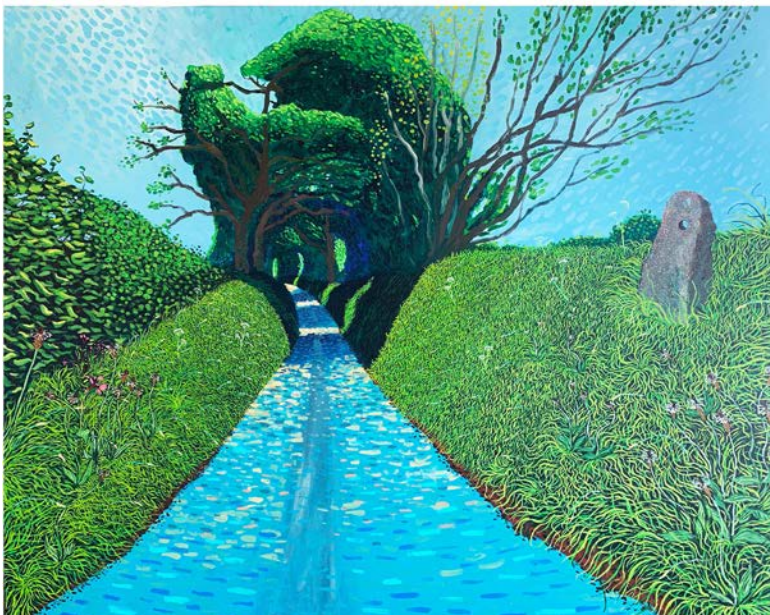
Jacques Le Breton Tree Tunnel 120cm x 150cm Acrylic on canvas £3,000 +GST