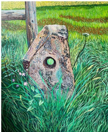
Jacques Le Breton Gate Post Series 3, 2021 51cm x 61cm Acrylic on canvas £1,000 +GST