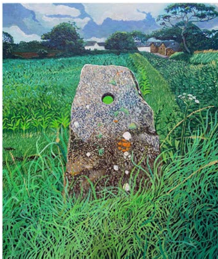
Jacques Le Breton Gate Post Series 5, 2021 51cm x 61cm Acrylic on canvas £1,000 +GST