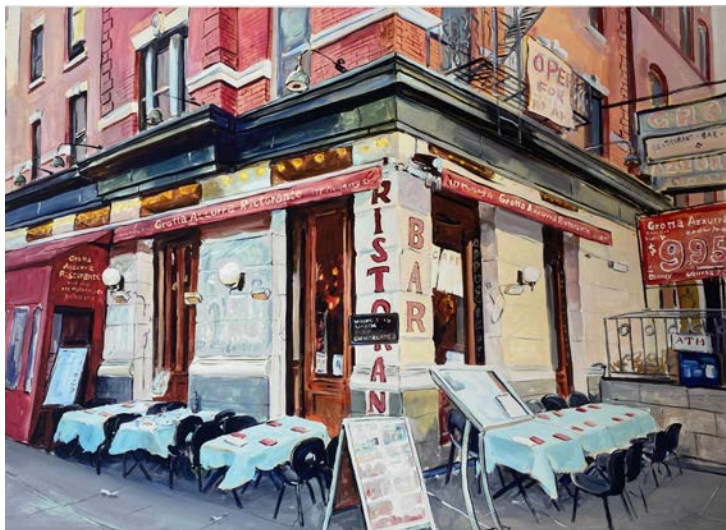
Bob Dylan Little Italy, Lower Manhattan, 2019 101cm x 76.3cm Giclée £9,000 +GST