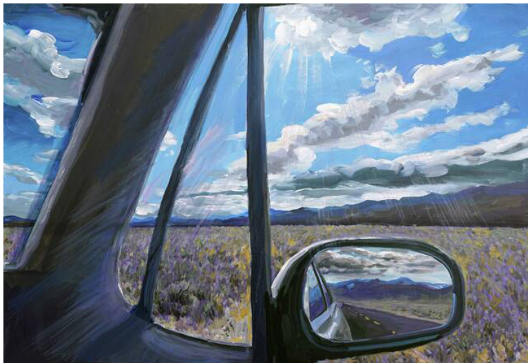
Bob Dylan Sideview Mirror Framed size: 35.0in x 29.0in Fine art print £3,900 +GST