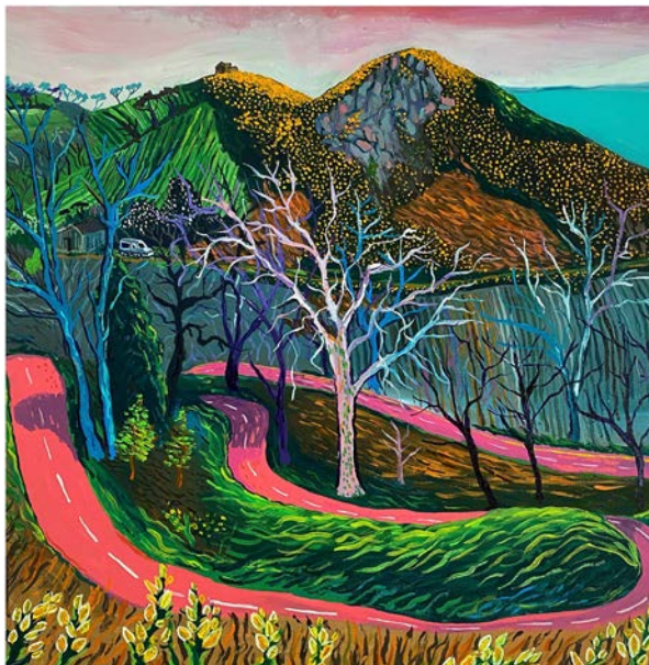
Jacques Le Breton Bouley Bay Hill, 2021 50cm x 50cm Acrylic on canvas £600 +GST