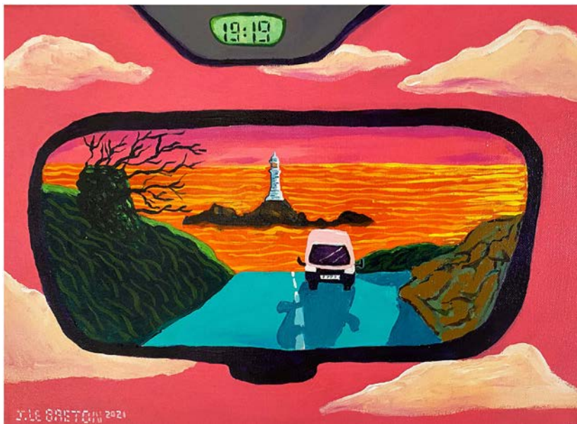
Jacques Le Breton Corbiere, 2021 30xm x 42cm Acrylic on canvas £350 +GST