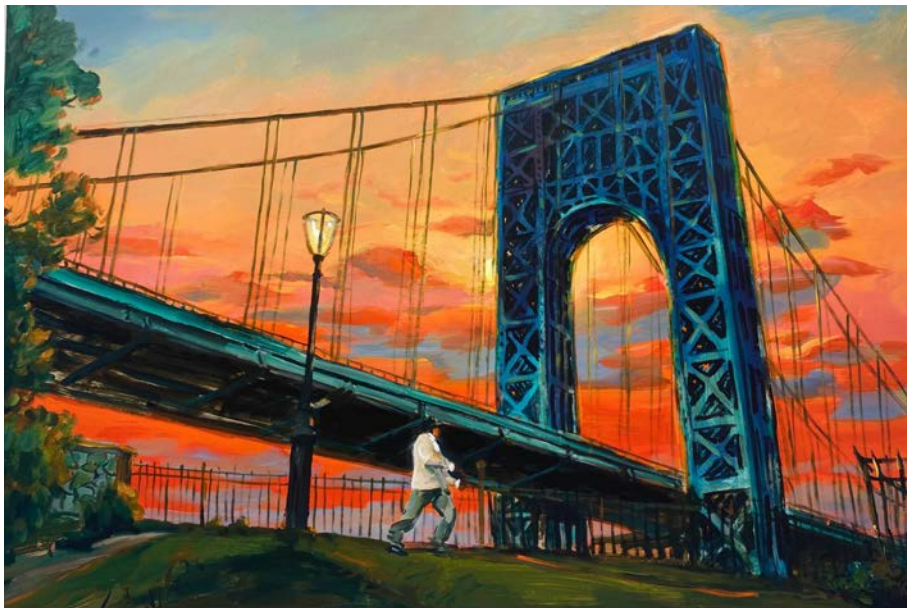
Bob Dylan Under the bridge , 2019 76cm x 58cm Giclée £3,700 +GST