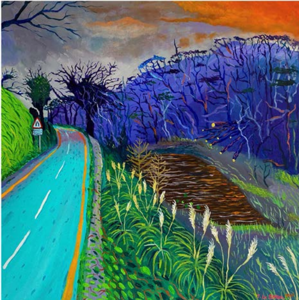
Jacques Le Breton Rozel Hill, 2021 550cm x 60cm Acrylic on canvas £600 +GST