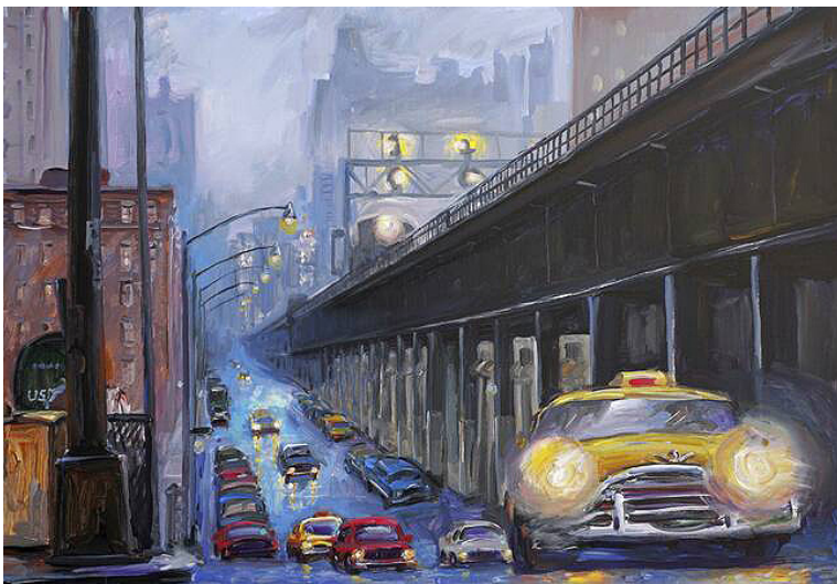
Bob Dylan Yellow Taxi Framed size: 35.0in x 29.0in Fine art print £3,900 +GST