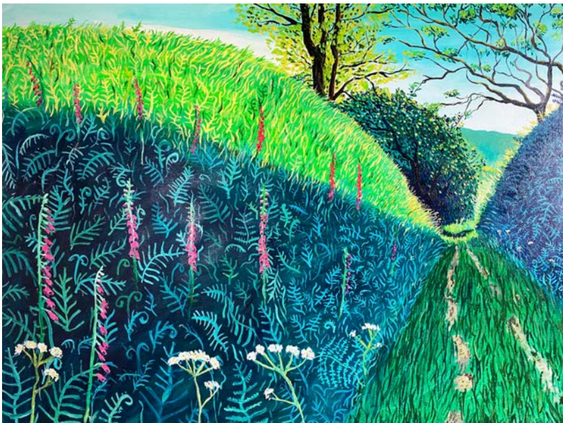
Jacques Le Breton Catel de Rozel 77cm x 102cm Acrylic on canvas £750 +GST