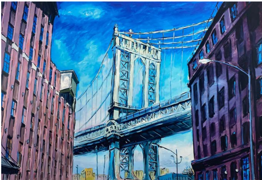
Bob Dylan Manhattan Bridge, Downtown New York, 2019 76cm x 58cm Giclée £5,500 +GST