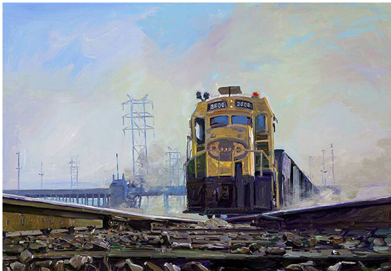
Bob Dylan Industrial Train Framed size: 35.0in x 29.0in Fine art print £3,900 +GST