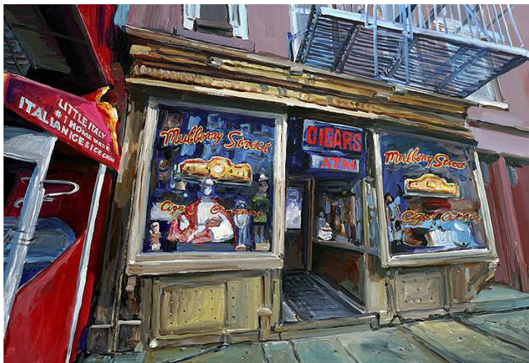
Bob Dylan Cigar Store Framed size: 35.0in x 29.0in Fine art print £3,900 +GST