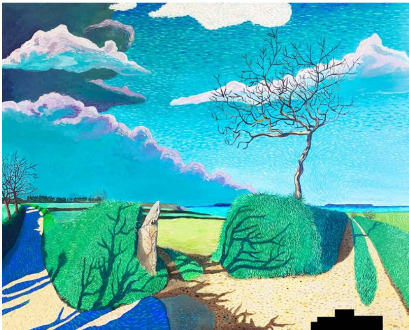
Jacques Le Breton North Coast Fields, 2022 120cm x 150cm Acrylic on canvas £3,000 +GST