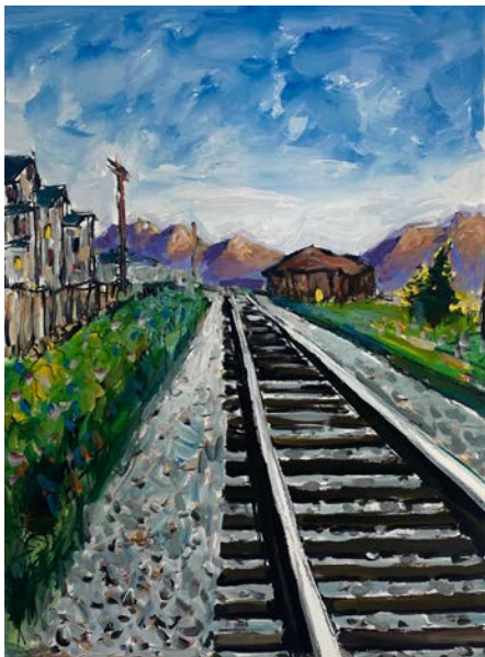
Bob Dylan Train Tracks, 2018 70cm x 56cm Giclée £11,000 +GST