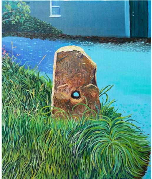
Jacques Le Breton Gate Post Series 1, 2021 51cm x 61cm Acrylic on canvas £1,000 +GST