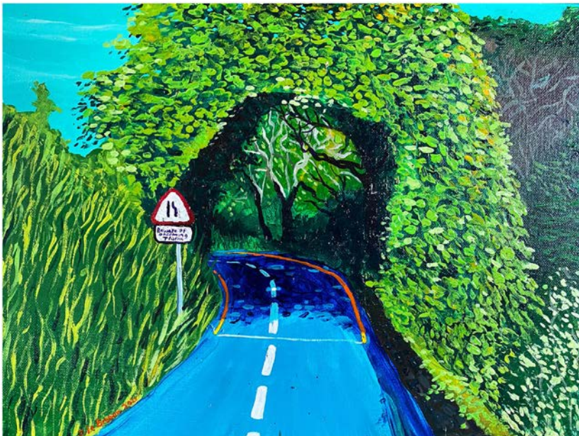
Jacques Le Breton Tree Tunnel, Rozel 40cm x 30cm Acrylic on canvas £350 +GST