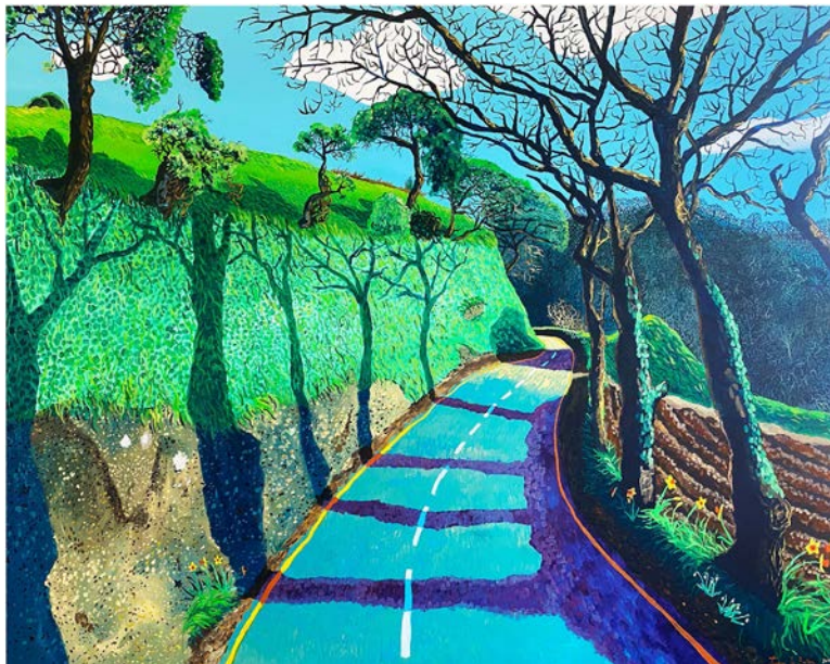
Jacques Le Breton Winter Shadows, 2022 120cm x 150cm Acrylic on canvas £3,000 +GST