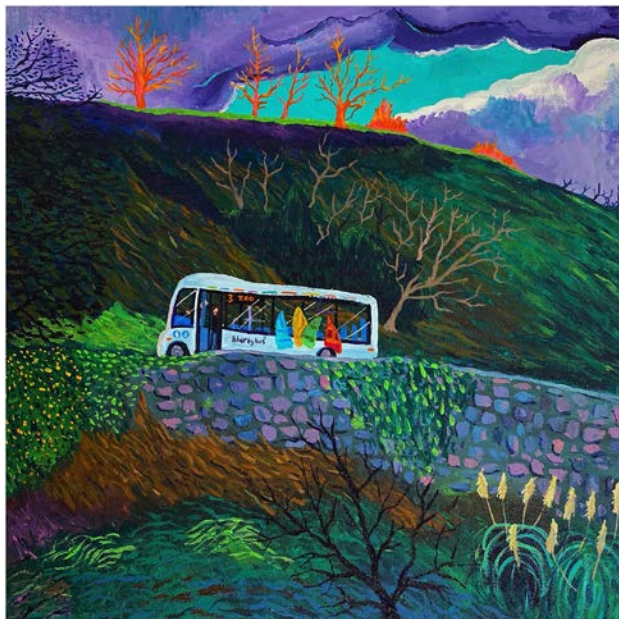
Jacques Le Breton The Number 3, 2021 40cm x 40cm Acrylic on canvas £500 +GST