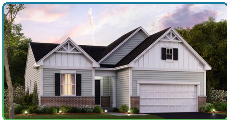
M/I Homes Beckett Landing South Elgin

Kane County is among several Chicago-area counties experiencing renewed population growth, according to new U.S. Census Bureau estimates. From 2023 to 2024, Kane County's population increased by 3,756 residents, reaching a total of 520,997. The communities of Hampshire and South Elgin led the county in population gains. MORE