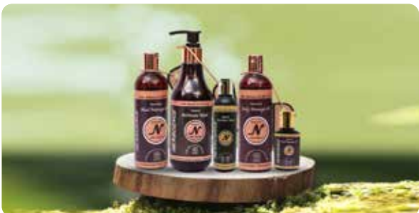
Stress Relief & Hygiene