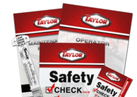
Vehicle Information Package (Standard)