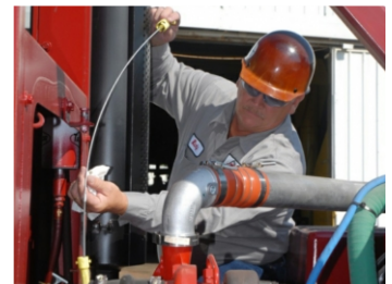
Easily Accessible Daily Checks