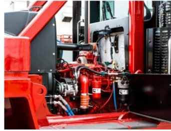
Easy Access to Drive Train & Hydraulics