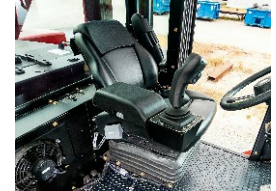
Fully Adjustable Air Ride Seat (Standard)