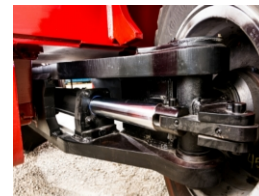
Industry's Toughest Steer Axle (Standard)