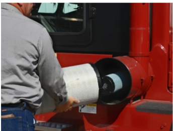
Donaldson Air Cleaner with Safety Element (Standard)