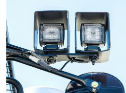
8 LED Work Lights (Standard)