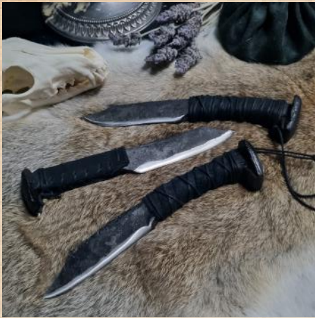
Athames (Ritual Blades)