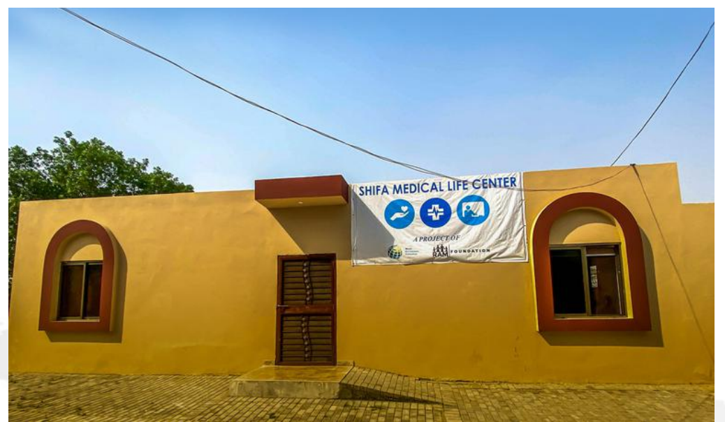
Medical Life Center completed.

World Compassion Fellowship began construction of a new Medical Life Center that would serve such minorities who end up in bondage, laboring for generations in the extreme heat and awful working conditions of brick kilns. The Life Center will be open to serve patients starting in 2022.