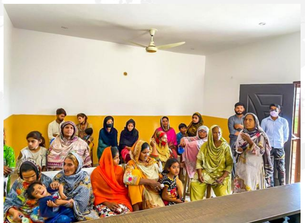
Patients waiting to be attended.