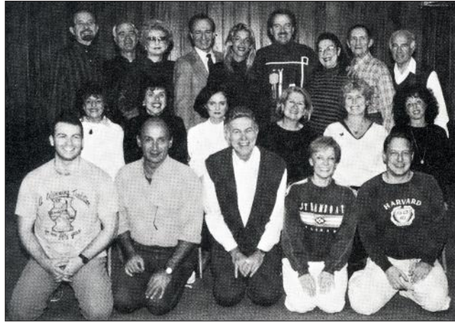
Cast photo from a 1991 production of “Hot Sake with a Pinch of Salt.”

“Shortly after joining Temple Israel about 30 years ago, I was asked by Eileen Putterman, z”l, to come to a Milk and Honey