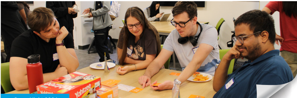
Game Night 2024