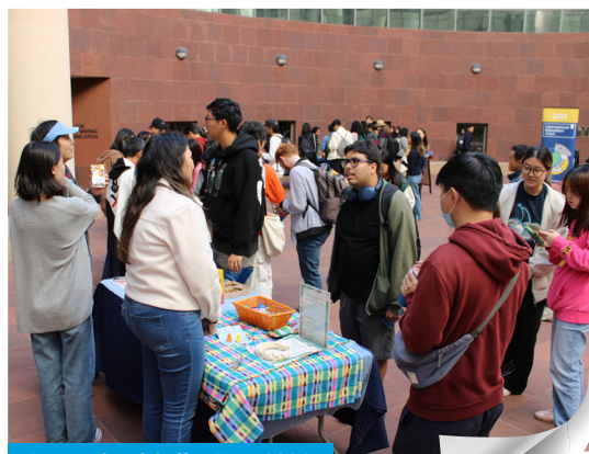
International Coffee Hour 2024