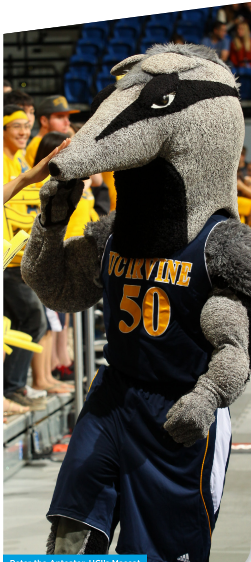
Peter the Anteater, UCI's Mascot

Rainy season in Southern California runs from December to March.