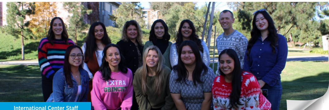
International Center Staff

Cars driven in California must be registered through the Department of Motor Vehicles. Evidence of financial responsibility must be carried at all times in the vehicle. Most Californians maintain financial responsibility through insurance companies, which provide the policy holder (you) with an identification card as evidence of coverage. The card must state the insurance company's name, address, period of coverage and policy number.