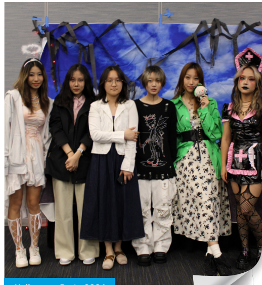
Halloween Party 2024