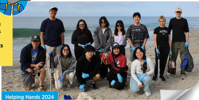
Helping Hands 2024

Once you obtain your new I-20 or DS-2019 from UCI, consult the "Who pays – or does not pay – the I-901 SEVIS fee and when is it paid?" page: www.ice.gov/sevis/i901/faq