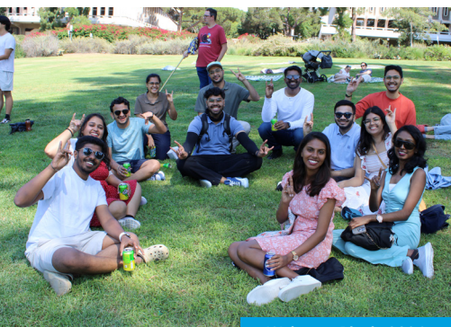
Welcome Picnic 2024

The New International Graduate Student Orientation helps new international students navigate their graduate career at UC Irvine. This event, in addition to school/department-based orientations, covers common aspects of the UCI international graduate student experience. Sessions include graduate support services as well as important administrative topics. This event gives new international graduate students the opportunity to connect with fellow international students from other disciplines across campus.