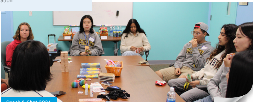
Snack & Chat 2024

Carry your new address information with your immigration documents when you travel because you will need the specific address of your destination.