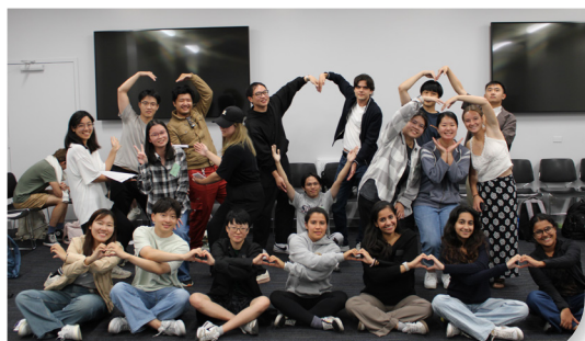
English Conversation Program

The International Center offers employment, internship, and volunteer opportunities to all students. Gain professional and leadership experience with the International Center!