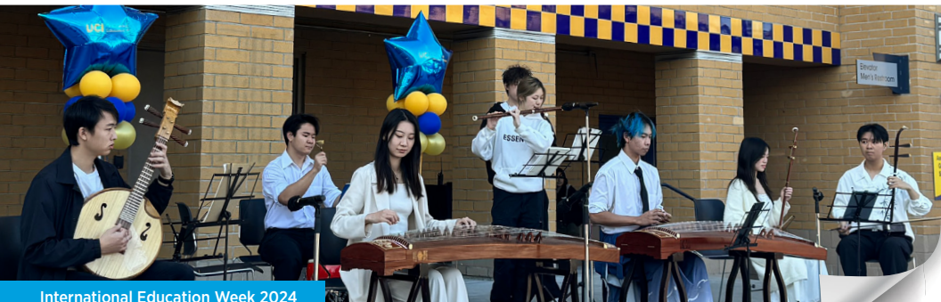
International Education Week 2024

studyinthestates.dhs.gov/getting-to-the-united-states