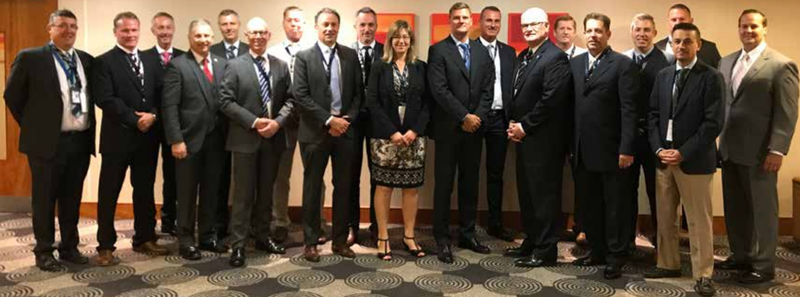
Heathrow Airport, London UK: Joint global AVSEC After Action and Security Review