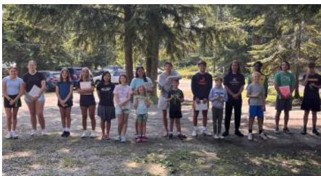
Campers of the Week (Week 3)