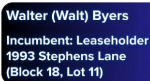
Walter (Walt) Byers

Leaseholder 1635 Park Avenue (Block 2, Lot 2 & 21)