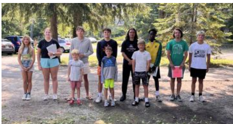
Campers of the Week (Week 2)