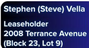
Stephen (Steve) Vella

Leaseholder 1705 Park Avenue (Block 2, Lot 14)