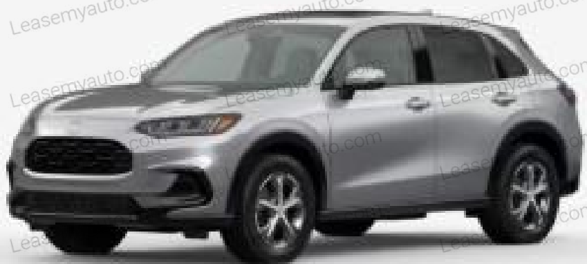
Lunar Silver Metallic