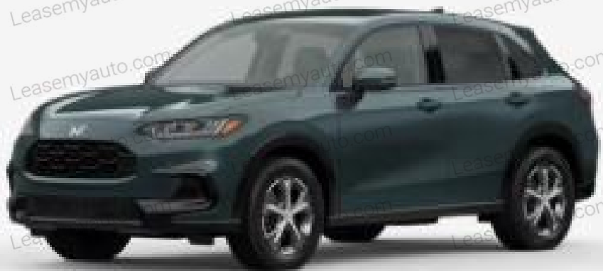
Nordic Forest Pearl