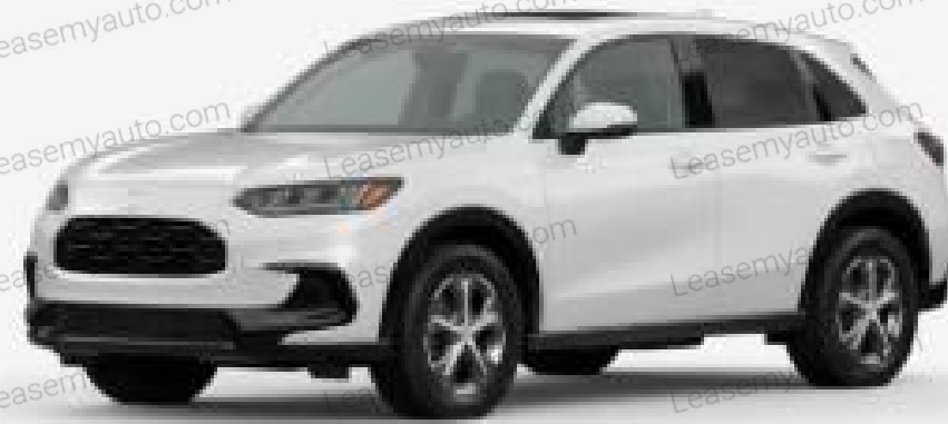
Platinum White Pearl