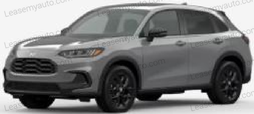
Urban Gray Pearl