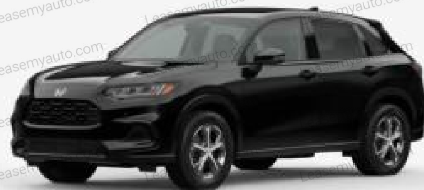
Crystal Black Pearl