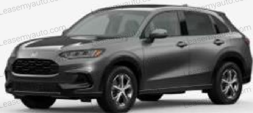
Modern Steel Metallic