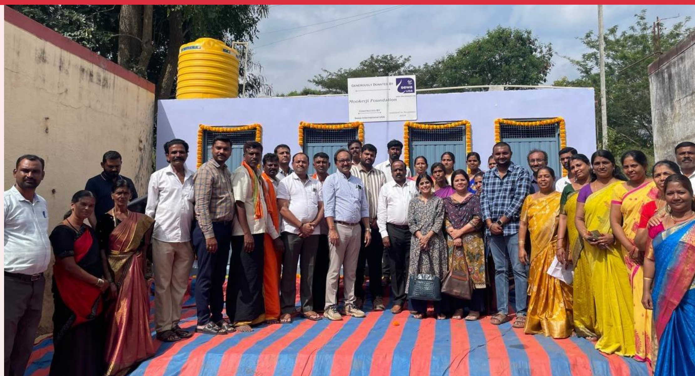
The SHE team and Education Officers inaugurated new toilets at two government schools in Mysuru District, Karnataka

Sewa's SHE (Sanitation, Hygiene, and Empowerment Project for the Girl Child) program inaugurated newly constructed toilet blocks at two government schools—GHPS (Government Higher Primary School) Marballi and GHPS Katoor in Mysuru/Mysore District.