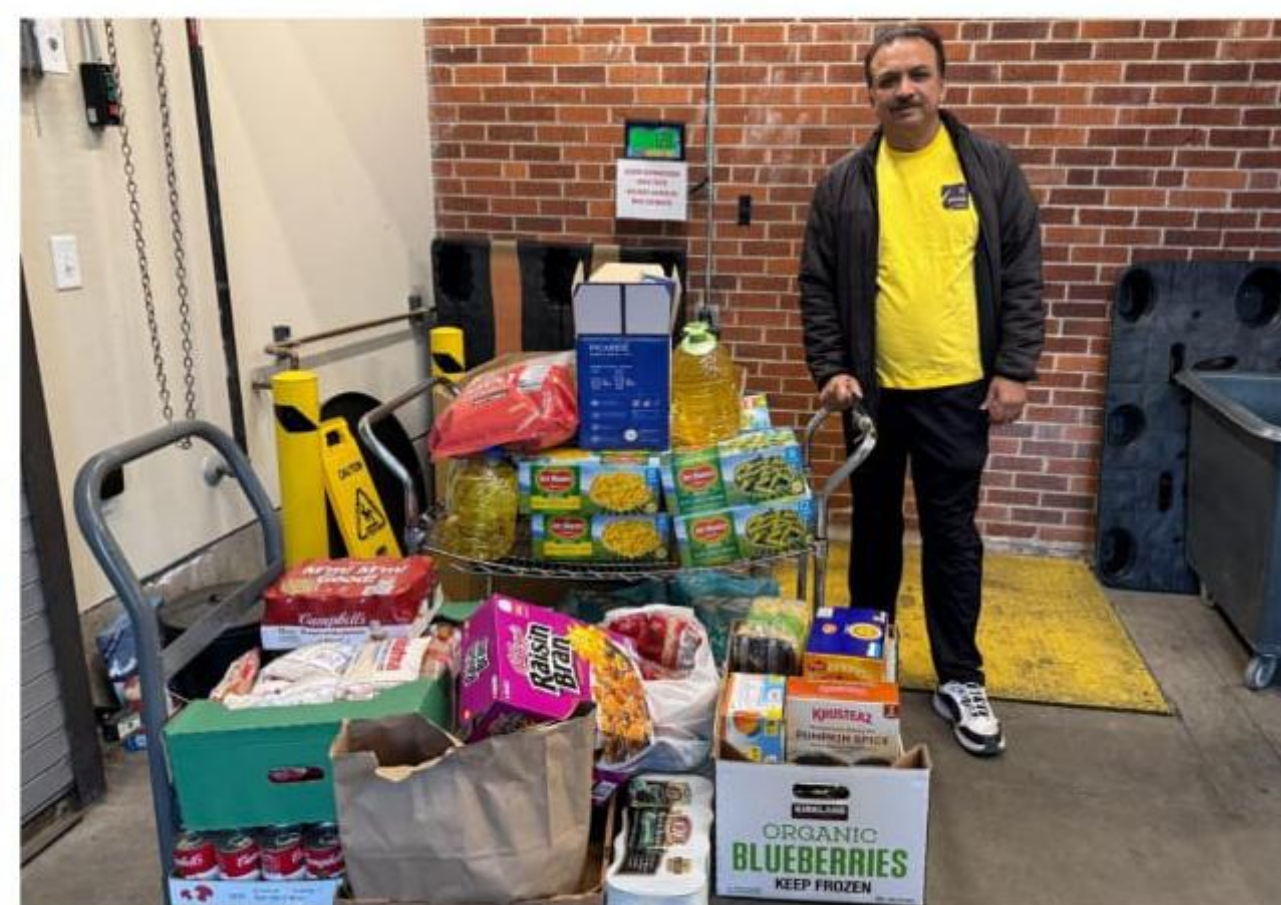
Sewa Tampa volunteers delivered food to Feeding Tampa Bay, while Sewa Colorado (bottom right) contributed to the OUR Center on Longmont, CO