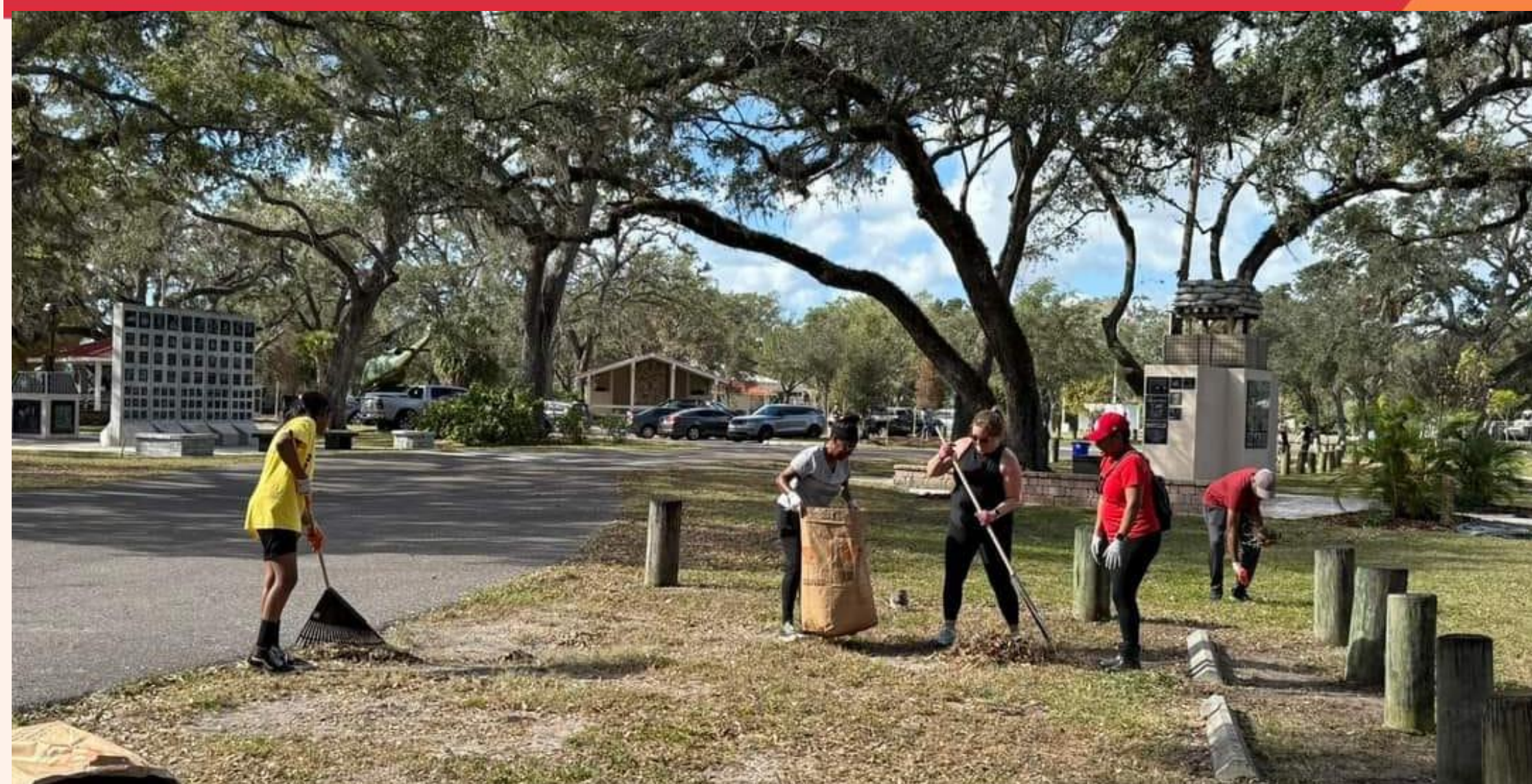
Sewa volunteers cleaned Veterans Park in Tampa, FL

During Veterans Day weekend, on November 9, a team from Sewa rolled up their sleeves to restore the charm of Veterans Park in Tampa, FL. The volunteers raked leaves, mulched garden beds, and cleared debris, ensuring the park remains a beautiful and welcoming space for the community. This hands-on effort was more than just environmental upkeep; it was a tribute to the men and women who served the nation. Sewa's collaboration with Keep Tampa Bay Beautiful (KTBB) amplified the initiative's impact, showcasing the power of teamwork and community spirit. Together, they make a tangible difference, one park at a time.