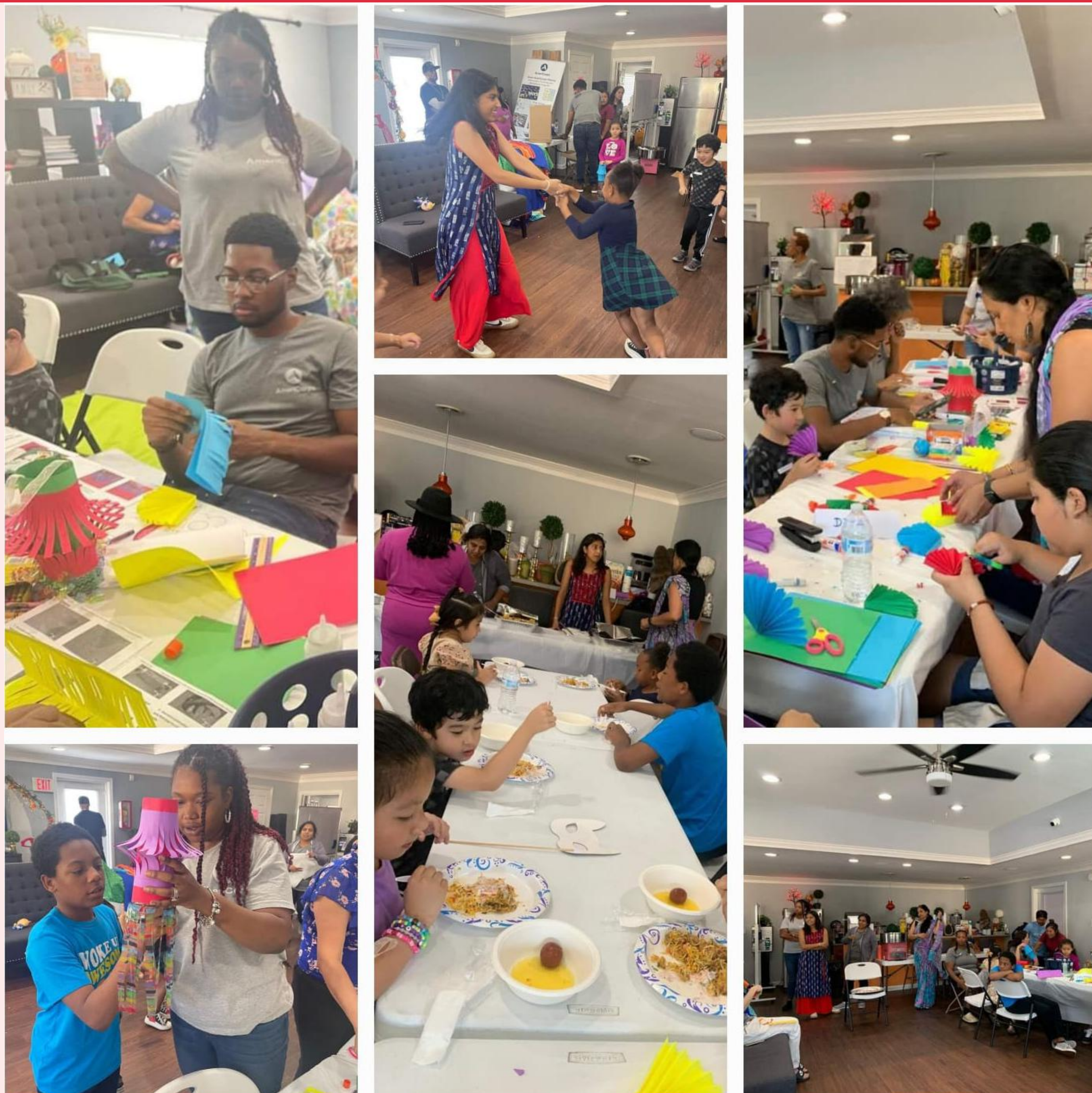
Families and students participating in the Sewa AmeriCorps Afterschool Tutoring program enjoyed hands-on activities at the Deepavali celebration in Atlanta