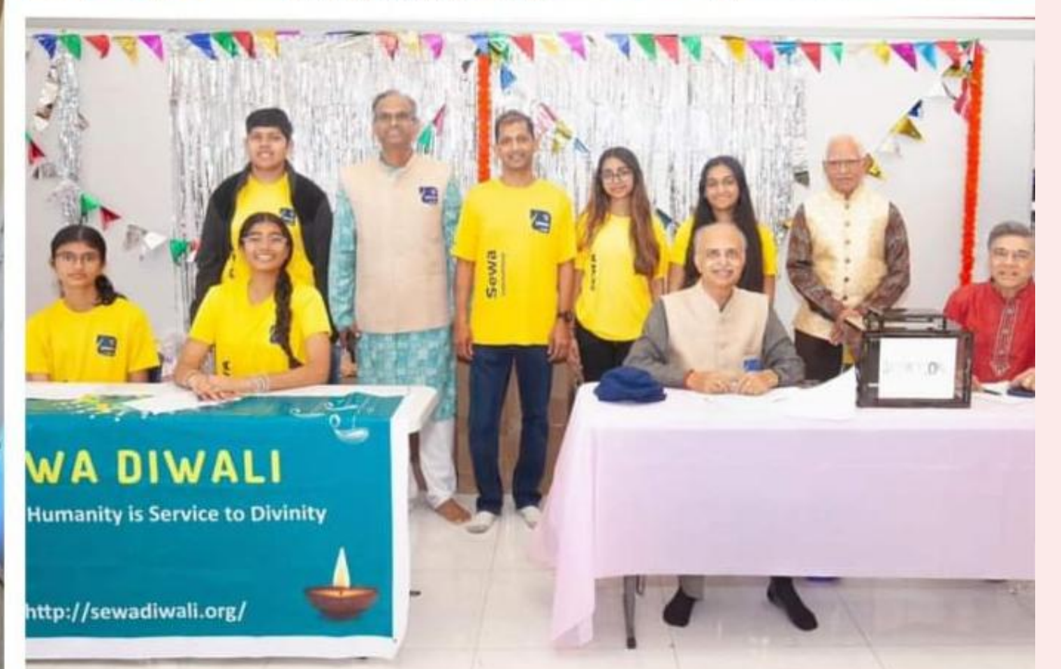
Sewa and partner organizations donated food to the Tunica-Biloxi Native American Tribe (top left & right) and the SewaDiwali Campaign families contributed to the Family Hope Pantry in Houston, TX