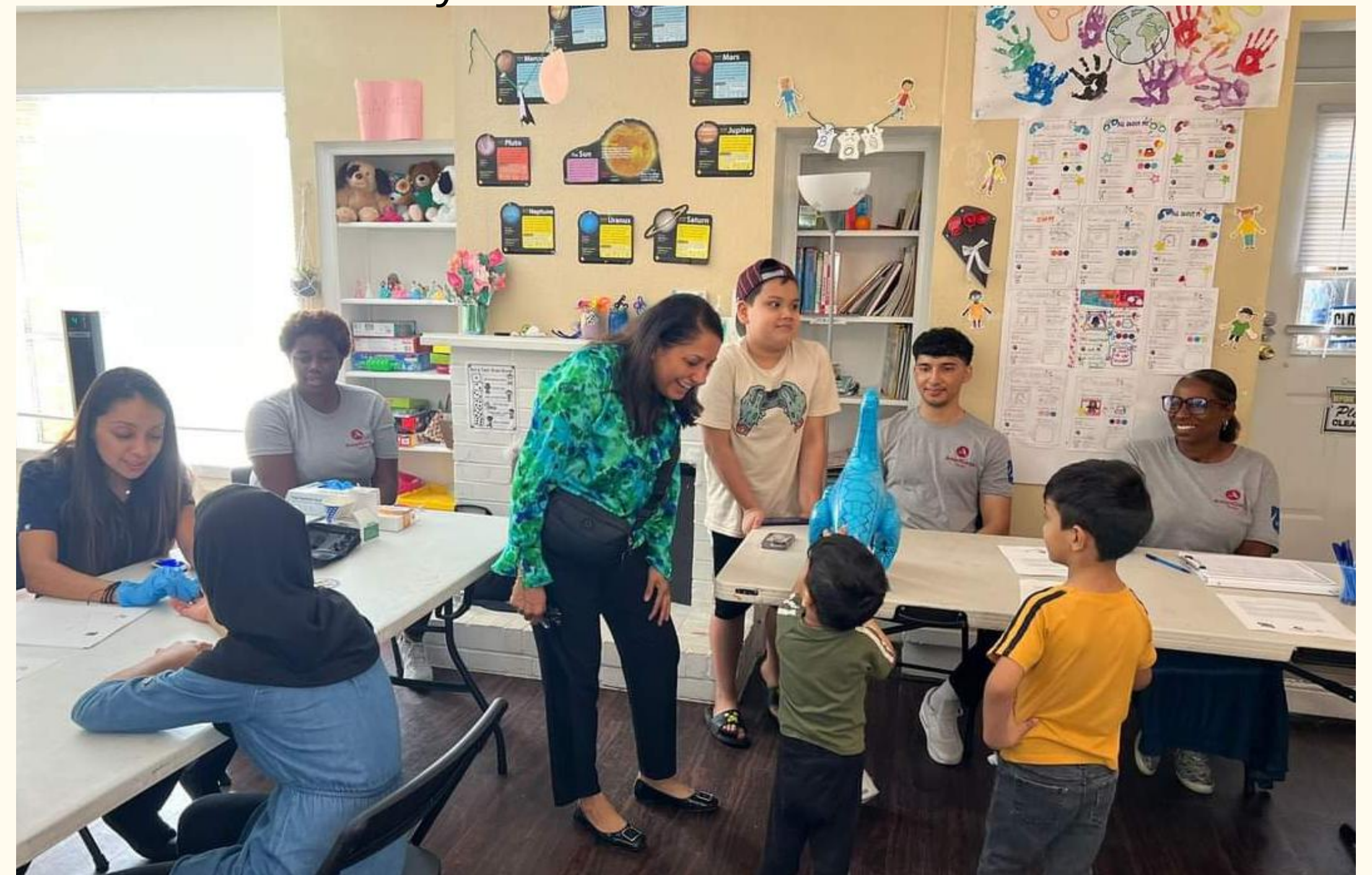
Sewa volunteers, in collaboration with AmeriCorps and the Indian Doctors Association (IDA), provided free health checkups at Aspire Health Clinics in Houston, TX

Sewa Houston, in partnership with AmeriCorps and the Indian Doctors Association (IDA), hosted free health clinics across all three Sewa Houston Community Centers on October 26. These clinics offered essential health screenings, facilitated by Aspire Clinics, to promote wellness and access to healthcare in underserved communities. The initiative was made possible by the support of IDA and the dedication of Sewa volunteers to serve the community.