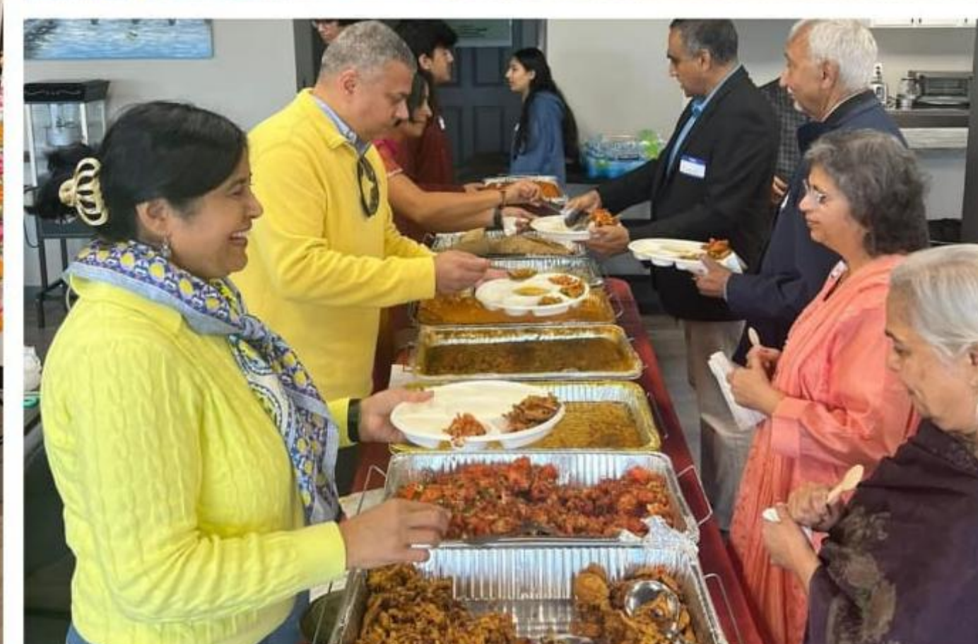
Sewa's senior executives joined McKesson's (top & bottom left) Deepavali celebrations, while Sewa Atlanta's Family Services program celebrated Deepavali at the Sewa Adultcare Center in Global Mall