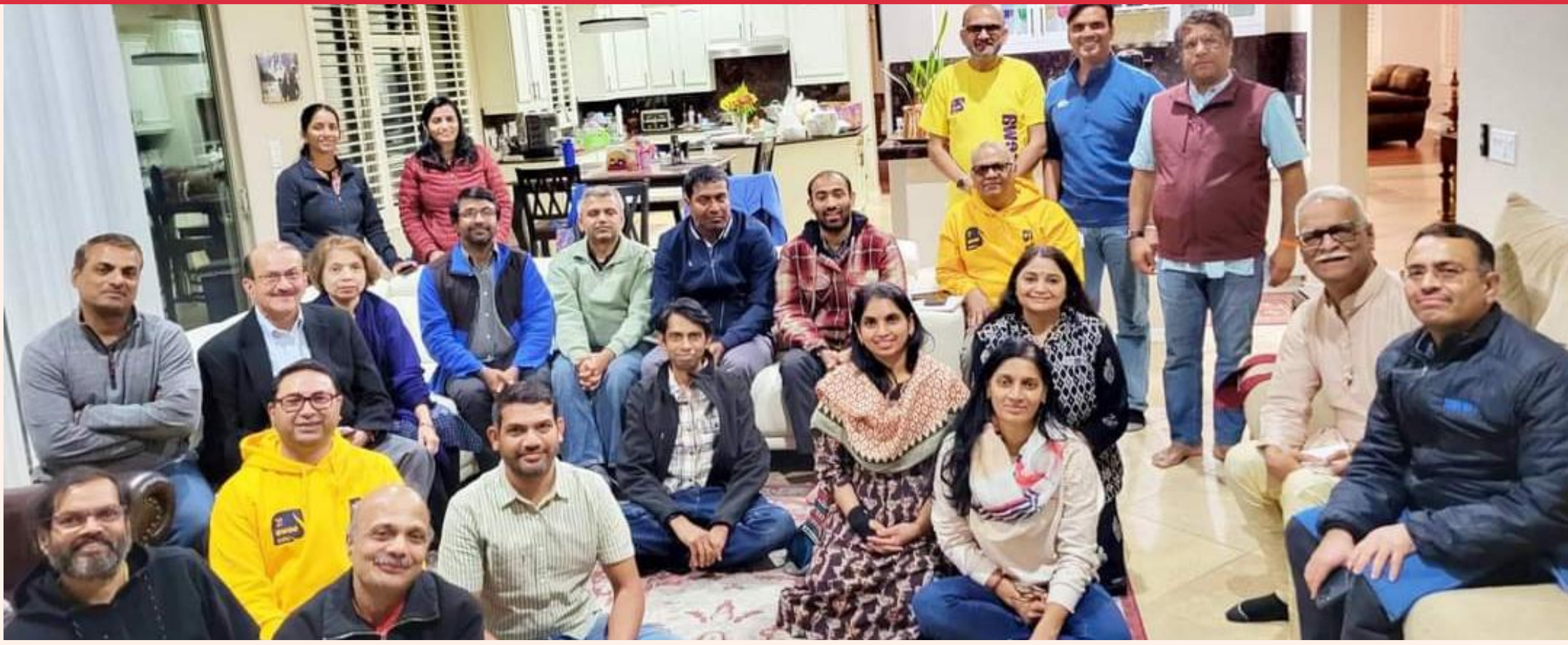
Sewa volunteers attending the workshop in Phoenix, AZ