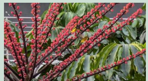
Birds visiting the flowers