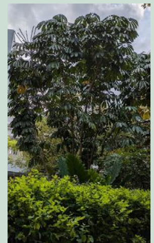
The tree as seen from the ground. The flowers can hardly be seen