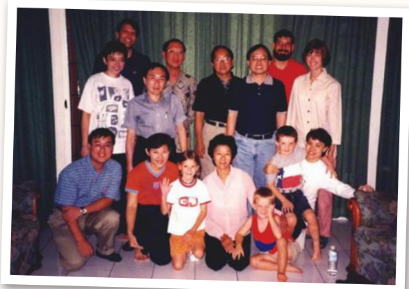
One of the groups from PSPC that visited the Mingland in the early 2000

The dominant religion is very strong. Those who leave the religion are disowned by their family and society. Indeed, the believers of "The Little Flock" have endured intense social pressure in the areas of housing and employment, and day-to-day discrimination and ostracism in education, health care, social and judicial services. Through the years, the labourers and fruits of The Little Flock mission work have gone through untold suffering, encountering discord, desolation, devastation and destruction attempts by Satan.