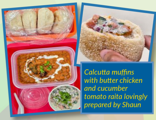
Calcutta muffins with butter chicken and cucumber tomato raita lovingly prepared by Shaun