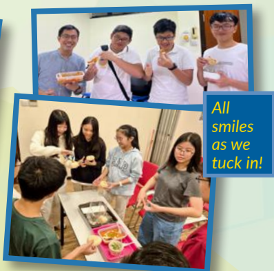
All smiles as we tuck in!