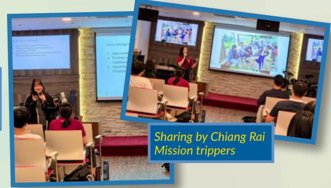
Sharing by Chiang Rai Mission trippers