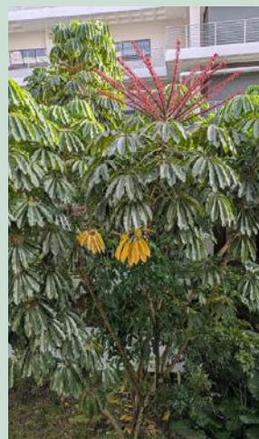
The umbrella tree, seen from the second storey

Do you have any feedback on The Messenger ? Do let us know at pspcmessenger@gmail.com