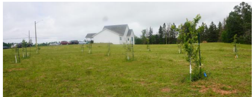
The Charlottetown SDA Church Orchard

Communications Director of the Maritime Conference