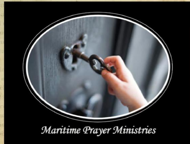
Maritime Prayer Ministries