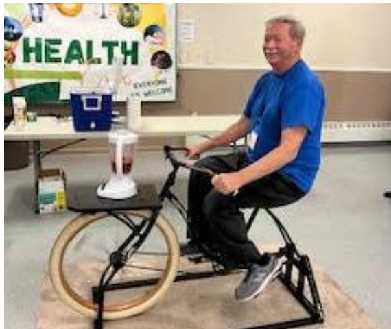
The blender bike constructed from repurposed bicycles by the Adventist Men's Group.

The event successfully reached and served approximately 50 participants, who engaged with each station and received practical health information, personal assessments, and lifestyle guidance.