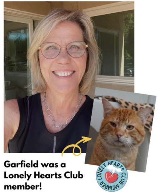
Garfield was a Lonely Hearts Club member!

"I would recommend volunteering to others because it's bringing love to an animal and bringing love to a person," she added. "It brings more love to the world!"