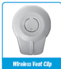
Wireless Vent Clip