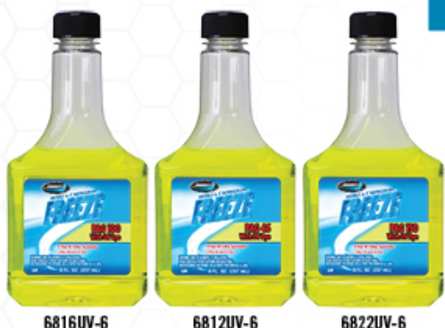
6816UV-6 6812UV-6 6822UV-6