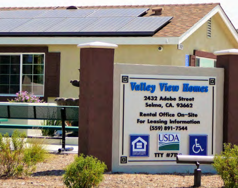
Valley View Homes