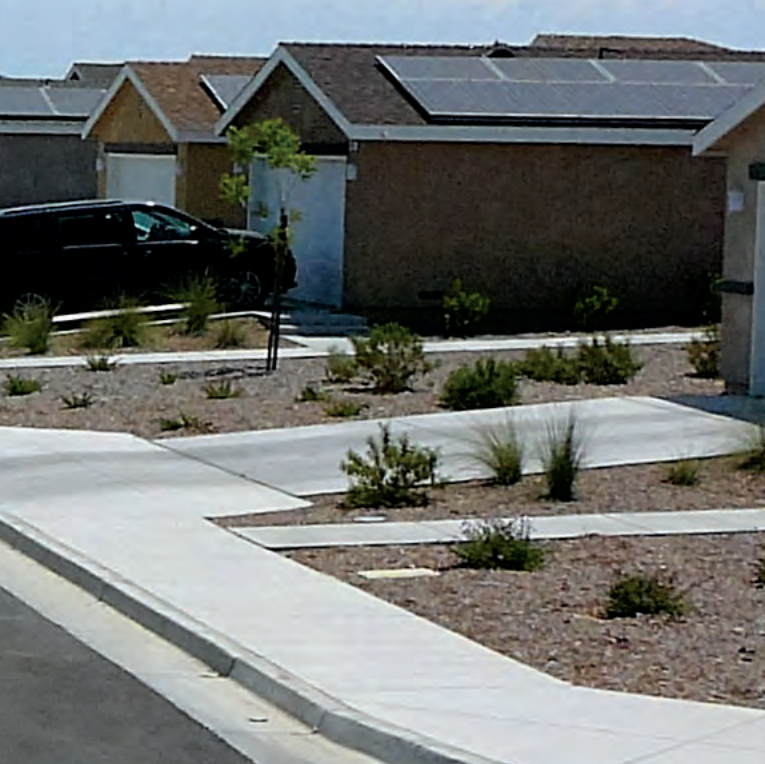
(top) A safe neighborhood where kids can ride bikes and play outside. (right) Oscar and Juana with their daughter.