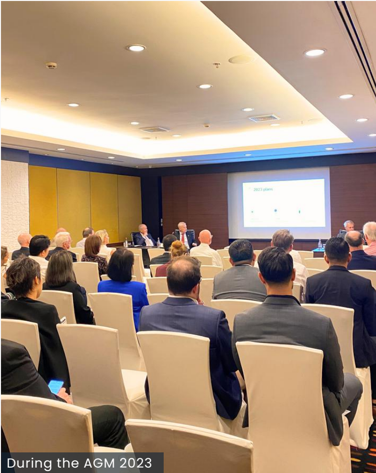
During the AGM 2023

We would like to warmly thank all members and friends who attended our Annual General Meeting (AGM) last week at the @landmark hotel!