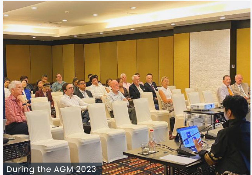
During the AGM 2023