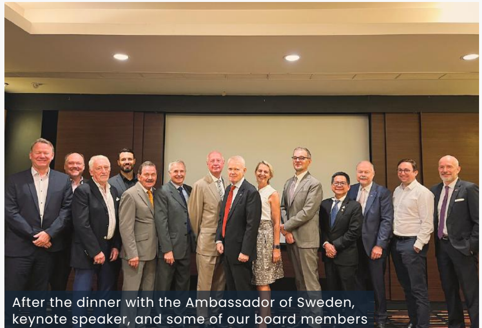
After the dinner with the Ambassador of Sweden, keynote speaker, and some of our board members