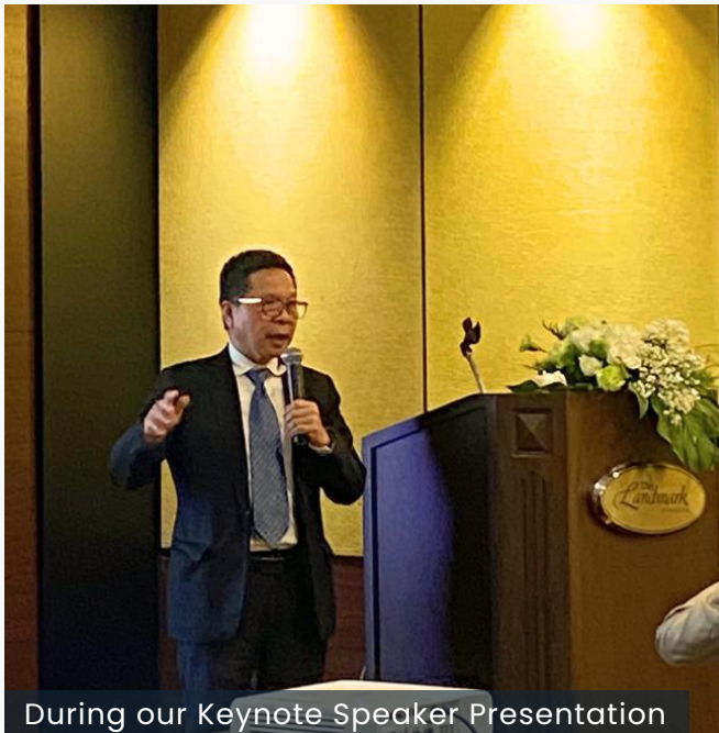
During our Keynote Speaker Presentation