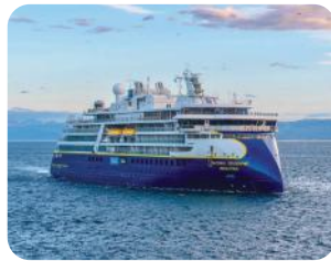
National Geographic Resolution 138 Guests | 76 Cabins Arctic, Antarctic, Patagonia, Europe, Asia, South Pacific