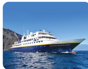
National Geographic Gemini 48 Guests | 28 Cabins Galápagos