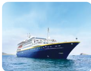
National Geographic Islander II 48 Guests | 26 Cabins Galápagos