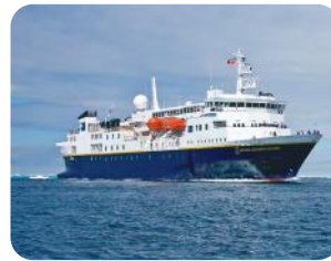
National Geographic Explorer 148 Guests | 81 Cabins Arctic, Antarctic, Patagonia, Europe, Canada