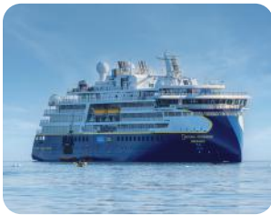
National Geographic Endurance 138 Guests | 76 Cabins Arctic, Antarctic, Patagonia, Atlantic Isles, Europe