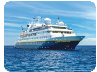
National Geographic Orion 102 Guests | 53 Cabins Antarctic, Patagonia, Atlantic Isles, Europe