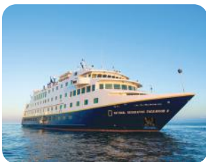
National Geographic Endeavour II 96 Guests | 52 Cabins Galápagos