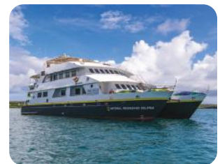
National Geographic Delfina 16 Guests | 8 Cabins Galápagos