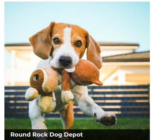
Round Rock Dog Depot