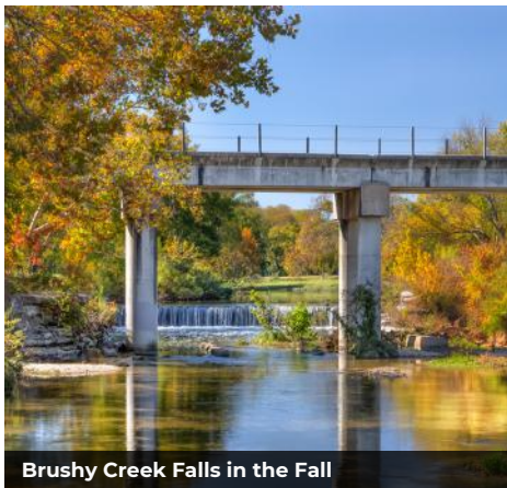
Brushy Creek Falls in the Fall

**Always check websites for park information, hours, and if reservations are needed.