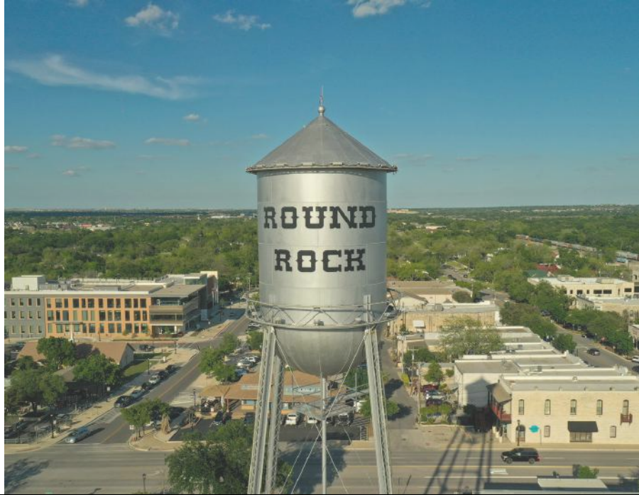
Round Rock Water Tower

Discover Round Rock, Texas: A city that balances economic progress and quality of life! Round Rock, Texas is a city that is quickly growing and has become a hub for economic advancement. It has also maintained an exceptional quality of life. The city has an esteemed master plan, a top-notch school district, and a remarkable park system.