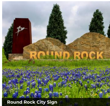
Round Rock City Sign