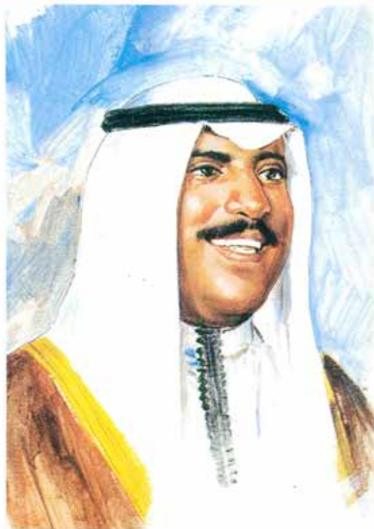
H. H. Shaikh Sa'ad Al-Abdullah Al-Salem Al-Sabah Crown Prince and Prime Minister