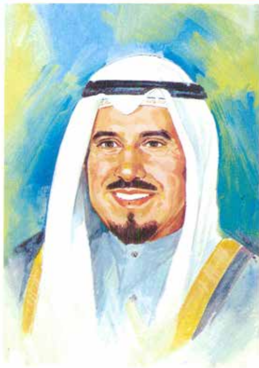
H. H. Shaikh Jaber Al-Ahmed Al-Sabah Amir of the State of Kuwait