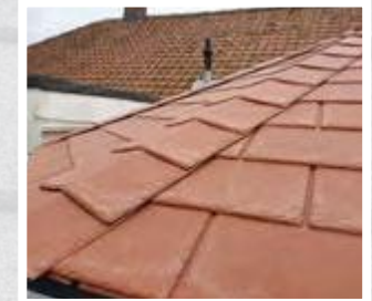
Classic Grey Chesnut Brown Antique Red