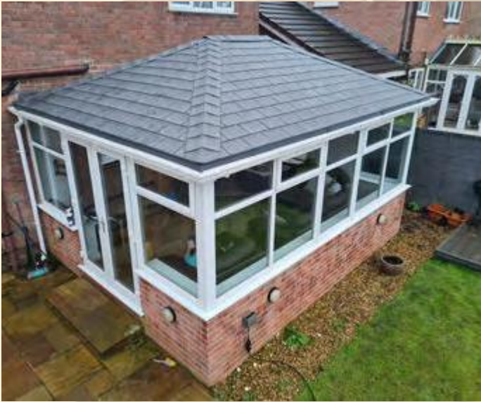
Double Hipped Edwardian