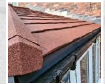
Russet Brown Charcoal Grey Rustic Red