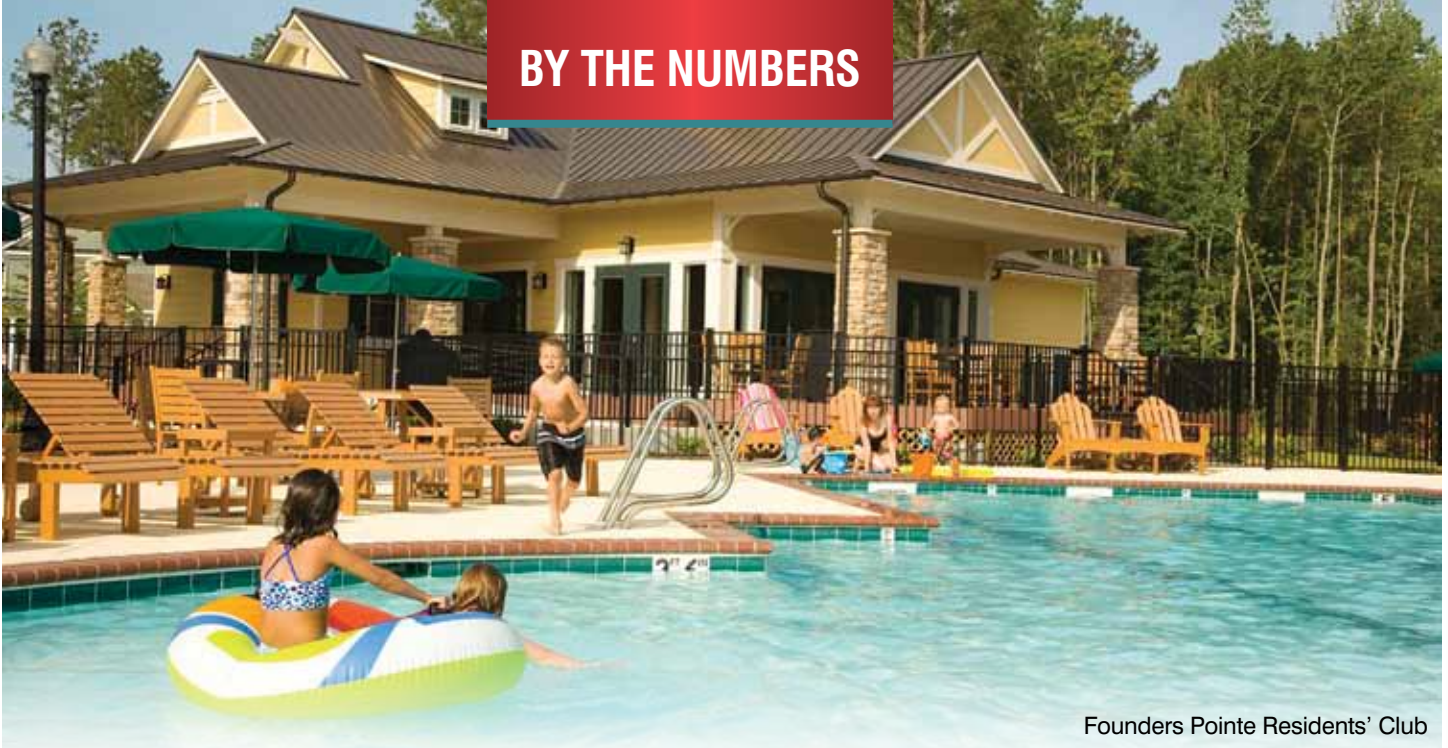
Founders Pointe Residents' Club