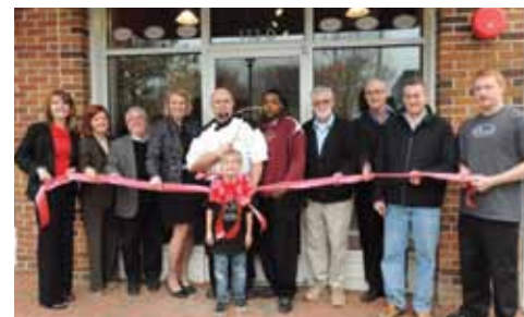
The Chamber of Commerce hosts ribbon cuttings for small businesses.

■ Sew Personal , Screen Printing & Embroidery changed ownership and relocated to 15221 Carrollton Blvd. in December.