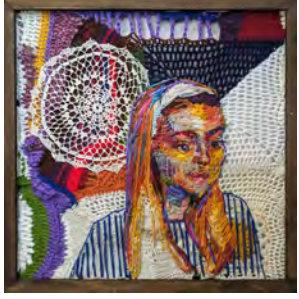
Interwoven Heritage by Keiko N. 1st Place, Grades 11-12, Teen Art Show 2024