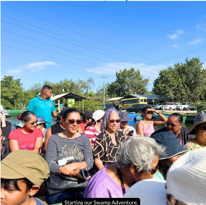
Starting our Swamp Adventure.