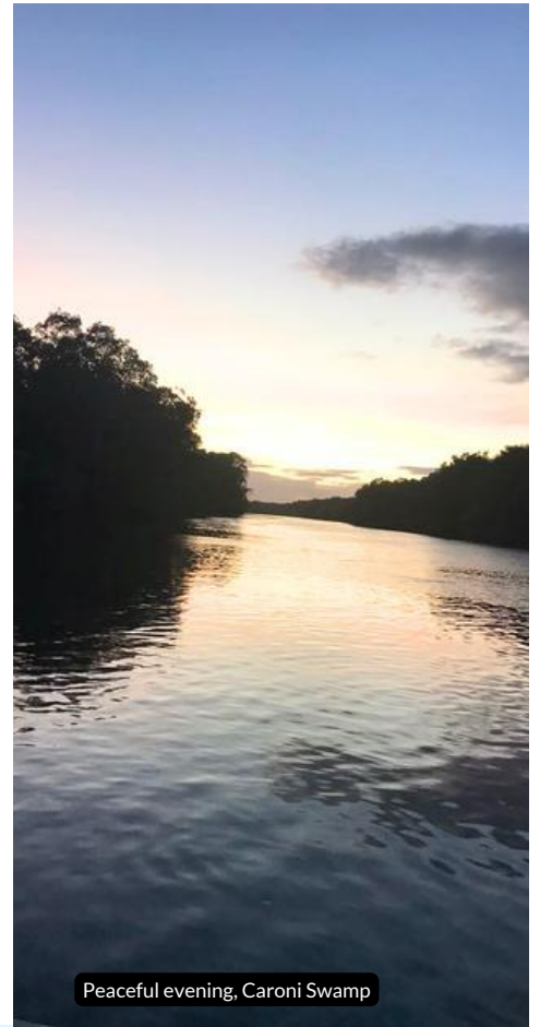
Peaceful evening, Caroni Swamp