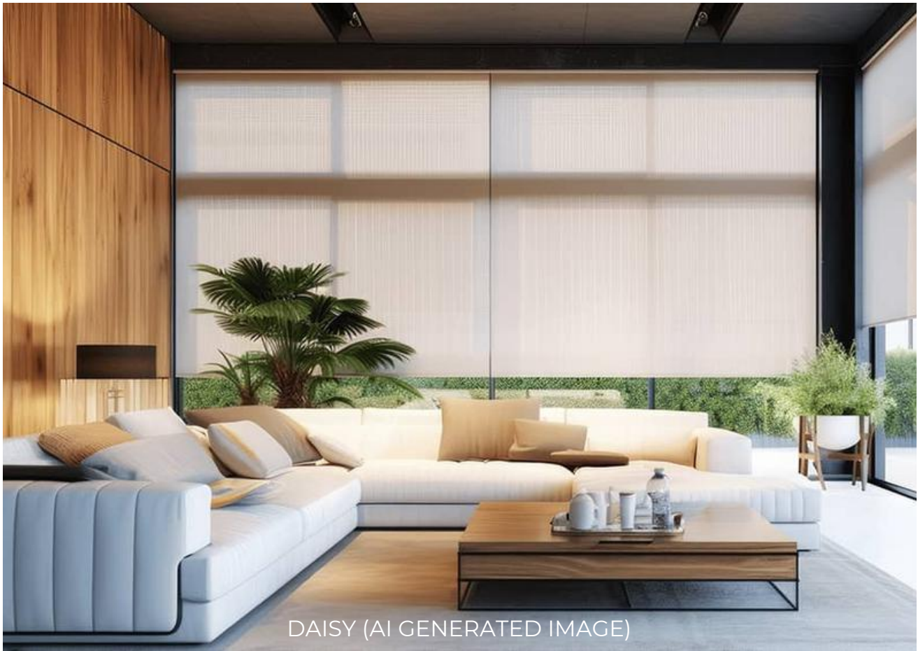
DAISY (AI GENERATED IMAGE)