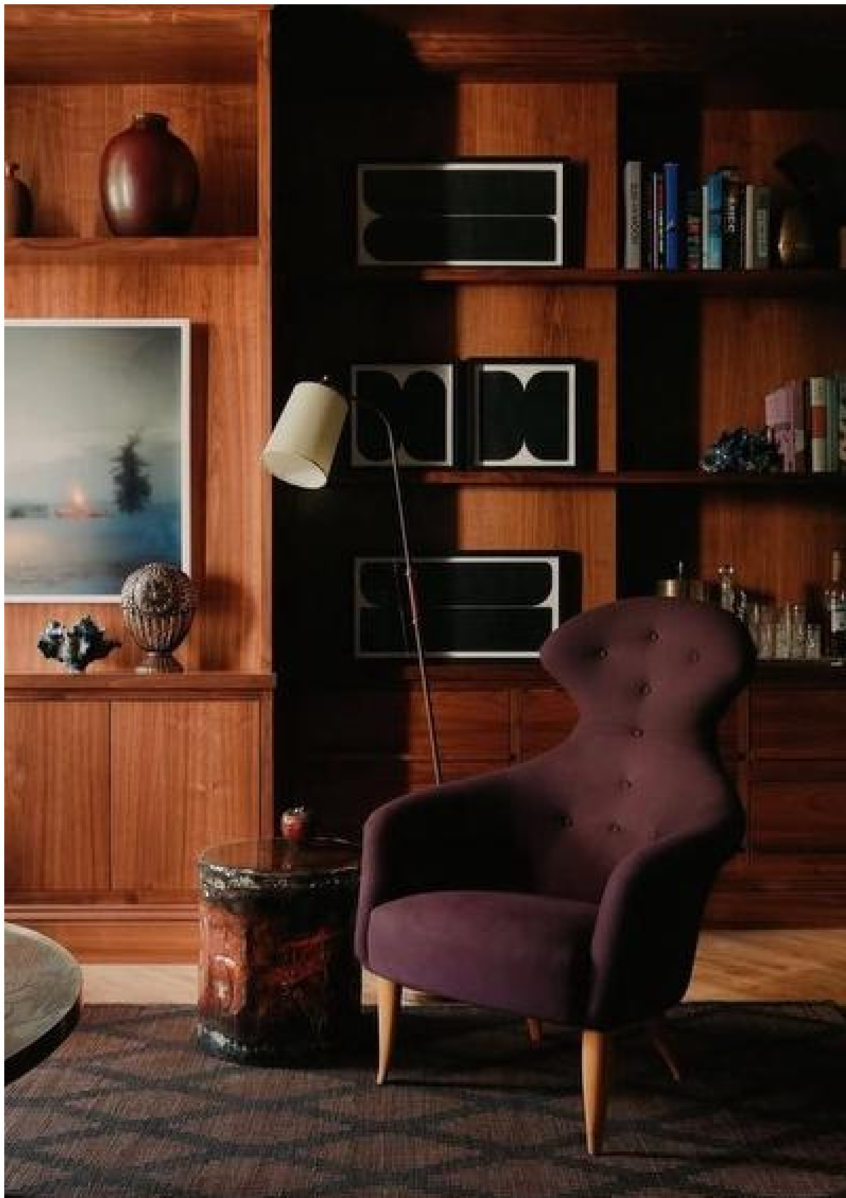
RUPP STUDIO PHOTOGRAPHED BY WILLIAM JESS LAIRD