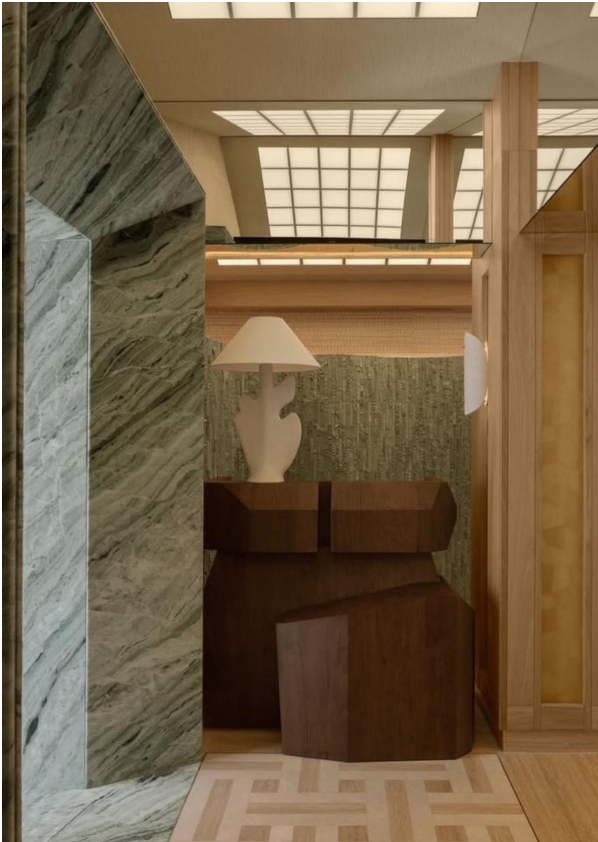
VERHALL STUDIO PHOTOGRAPHED BY NATELEE COCKS