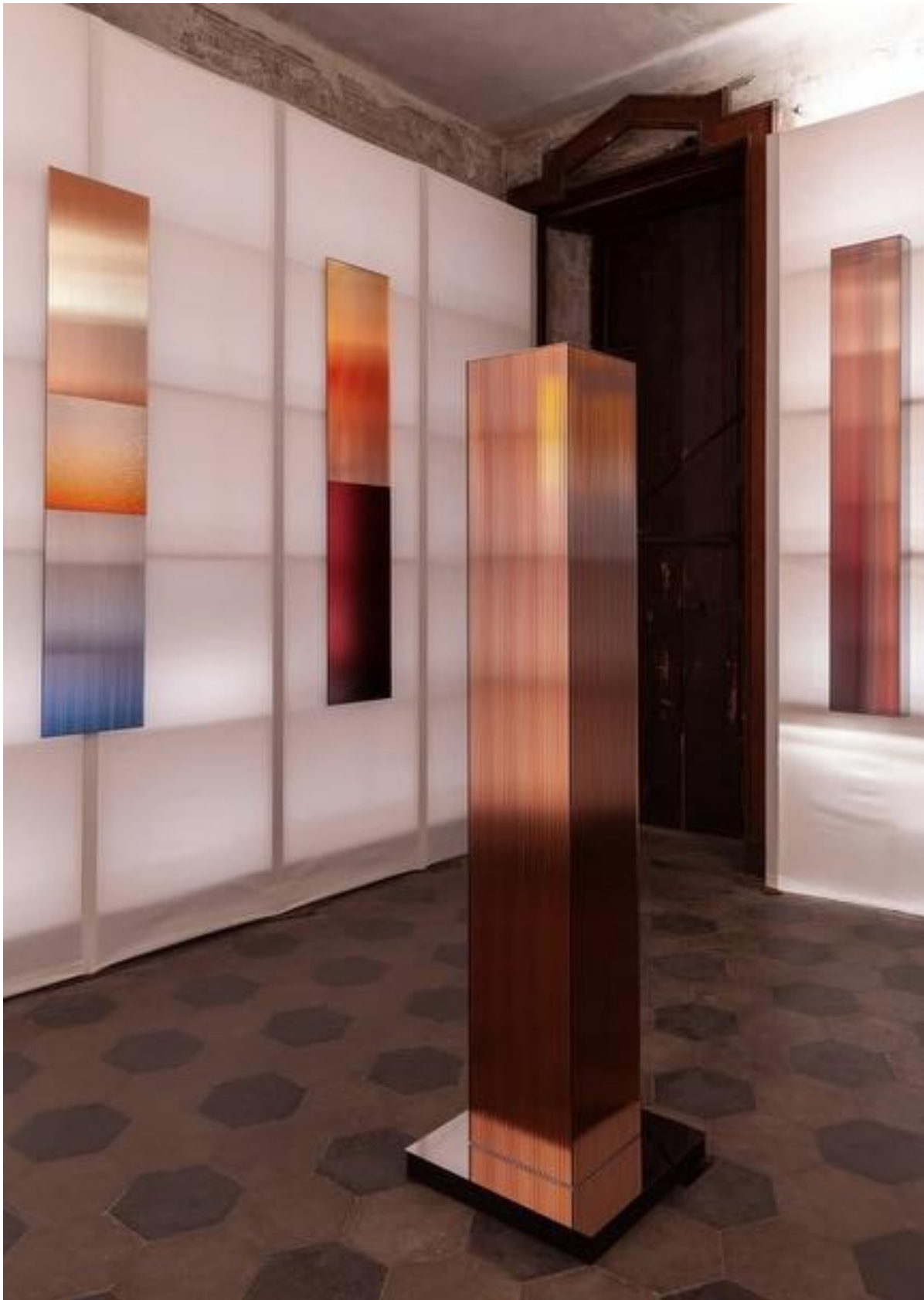
RIVE ROSHAN PHOTOGRAPHED BY AMIR FARZAD