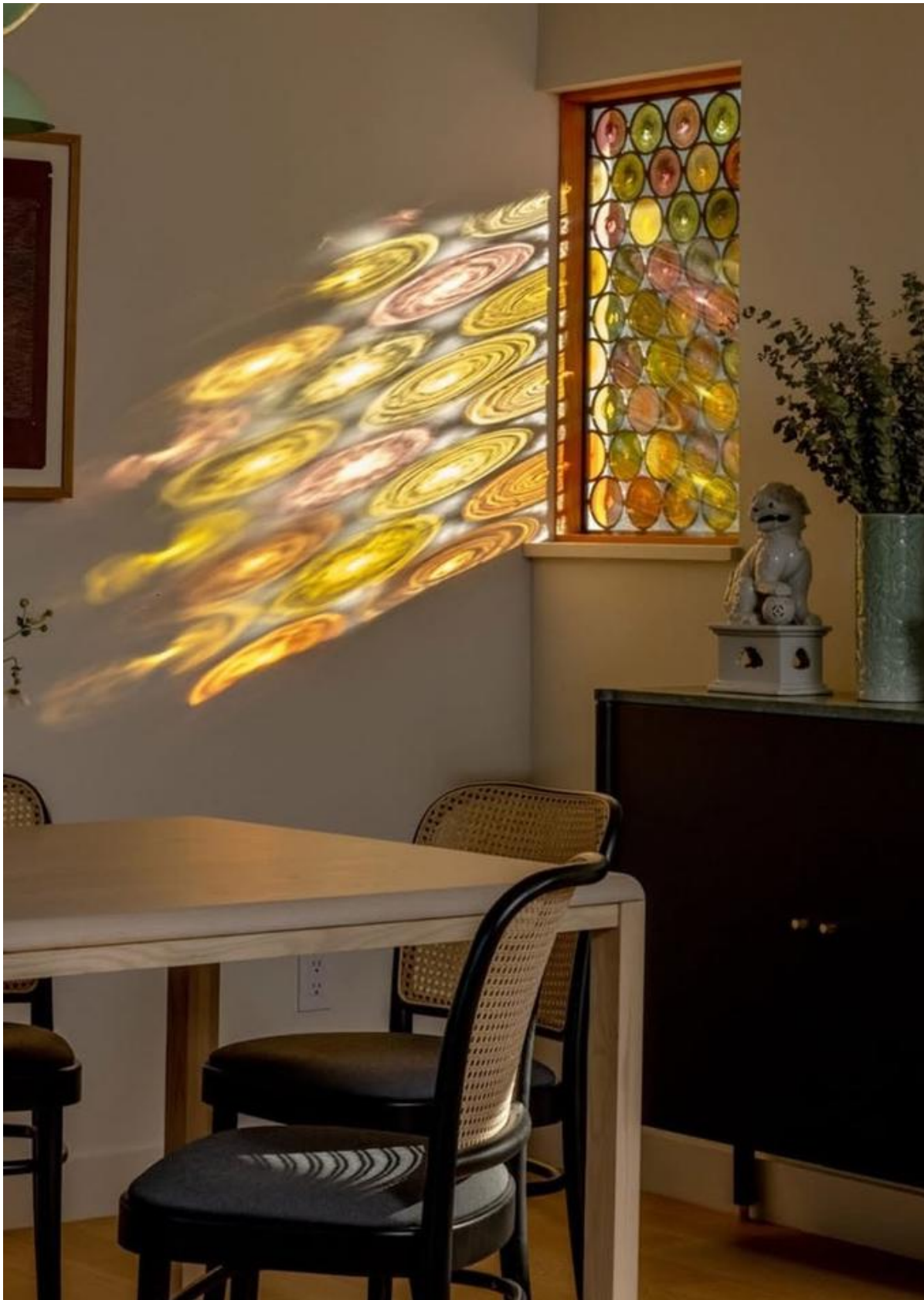
BEST PRACTICE ARCHITECTURE