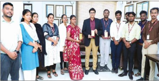
உயரதரமது விம்ஸ் அலைடு ஹெல்த் சர்வீஸின் கல்லூரிக்கு விருது

சேலம், மே-24 விம்ஸ் அலைடு ஹெல்த் சர்வீஸின் கல்லூரிக்கு விருது வழங்கும் விழாவில் கலந்துகொண்ட அமைப்பினர் மற்றும் கல்லூரி நிர்வாகிகள். விம்ஸ் அலைடு ஹெல்த் சர்வீஸின் கல்லூரிக்கு விருது வழங்கும் விழாவில் கலந்துகொண்ட அமைப்பினர் மற்றும் கல்லூரி நிர்வாகிகள்.