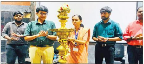
விம்ஸ் வளாக அலைடு ஹெல்த் சர்வீஸின் கல்லூரியின் சார்பில்