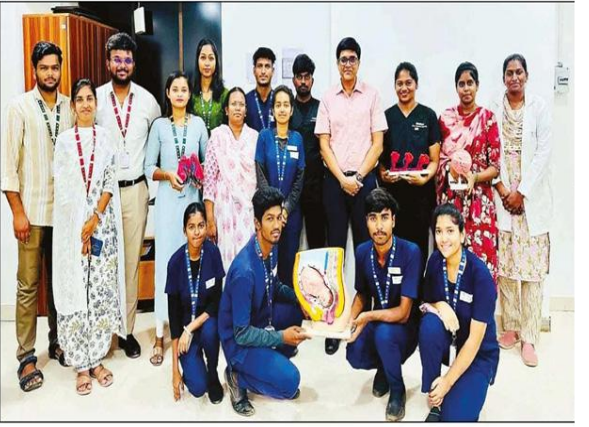
சேலம், மே-24 விம்ஸ் அலைடு ஹெல்த் சர்வீஸின் கல்லூரியில் மருத்துவ உதவியாளர் பிரிவுக்கு கல்வி யாதிக்கர் அன்பளிப்பு வழங்கும் விழாவில் கலந்துகொண்ட அமைப்பினர் மற்றும் கல்லூரி நிர்வாகிகள்.

விம்ஸ் அலைடு ஹெல்த் சர்வீஸின் கல்லூரியில் மருத்துவ உதவியாளர் பிரிவுக்கு கல்வி யாதிக்கர் அன்பளிப்பு