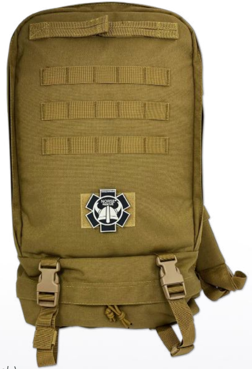
Velcro front enables personalized patches (patches sold separately).

The front of the bag features a Velcro area where you can attach your desired bag patch (NORSE RESCUE® bag patch sold separately), allowing you to personalize your bag.