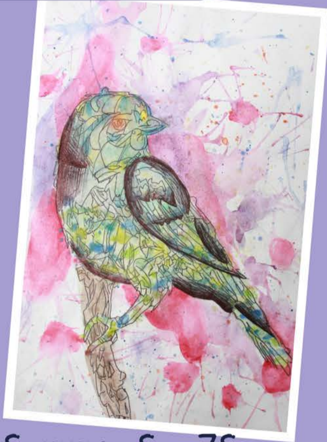
Summer S – 7S

The Art Department was filled with exceptional artwork this week, making it challenging to pick just one Artwork of the Week – so we decided to highlight two pieces instead!