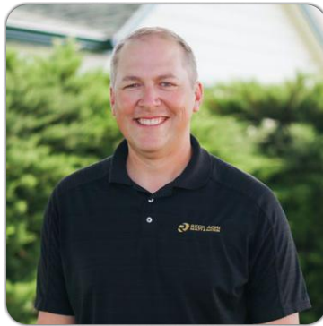
From the desk of BEN GARDINER Broker Associate

Once the amount of capital gain is determined, the percentage of capital gains tax can vary depending upon your individual tax bracket and state that you live in. In all situations, if you are considering a 1031 Exchange, be sure to consult with a 1031 intermediary and your tax professional to determine eligibility, potential tax savings and possible issues.