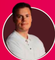
Organisation Robin Hut

Our Fan Support team is easily recognizable in and around the stadium, as well as in our House of the Devils. Feel free to approach them if you have any questions or problems.