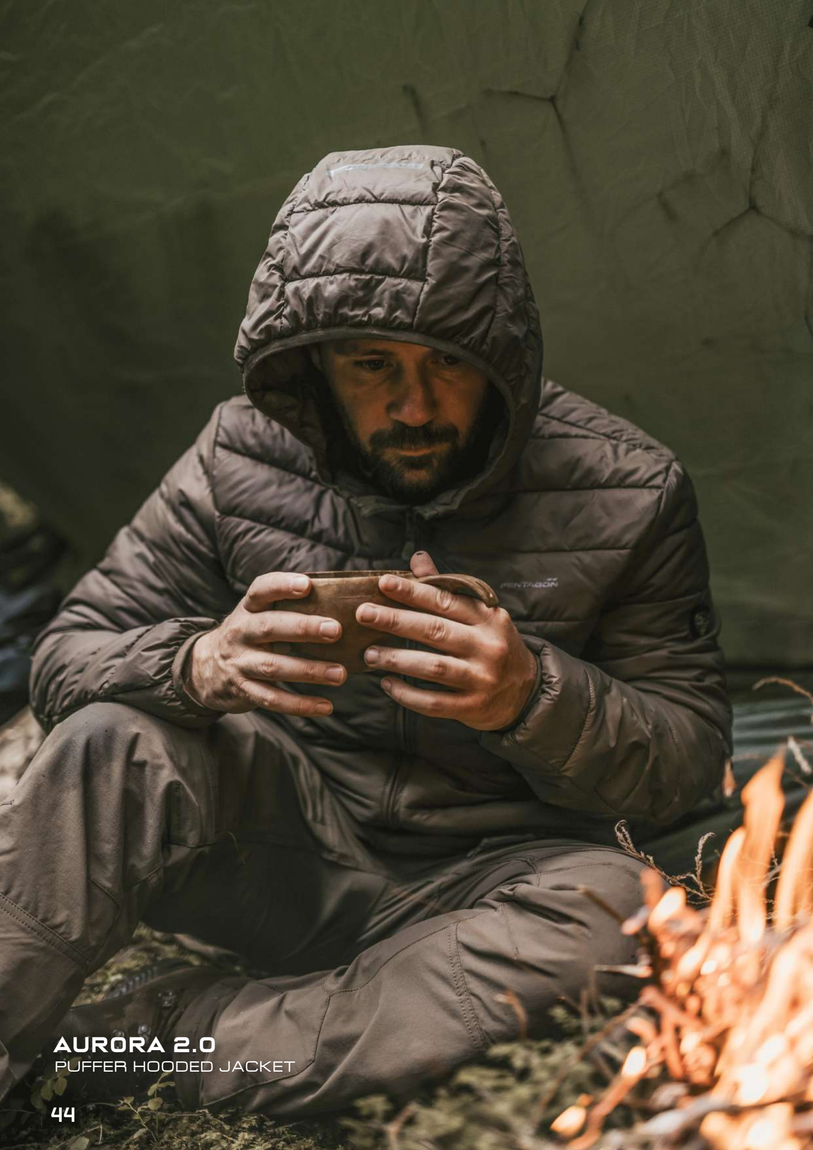
AURORA 2.0 PUFFER HOODED JACKET