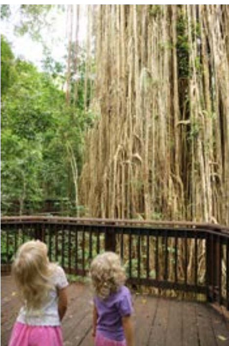
Curtain Fig NP (NPAQ Library)

Species specific relationships & partnerships: Trees and other life forms have co-evolved over centuries in Australian forests. Hence, they have built up close beneficial partnerships. For example, as a tree ages it starts to break down with the help of fungi and invertebrates (wood borers). In some instances one fungus species may be restricted to only one tree species. Some insects are found only at the tops of certain trees in our ancient rainforests.