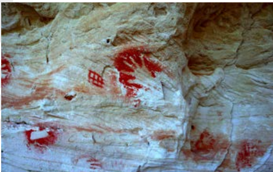
Art panel at the Conciliation Hill art site showing image enhancement using i-Dstretch. Note erosion of pigment around base and sides of hand stencil. This may have been due to cattle rubbing (NPAQ Library).

The future of protecting cultural heritage in Queensland requires active resourcing and empowerment of Traditional Owner's leadership of mapping and protection work.