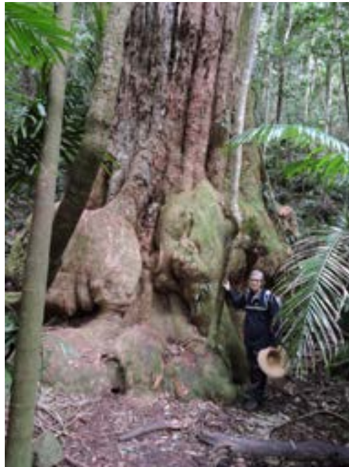
Brushbox, Lamington NP

In this article we will cover characteristics and values of veteran trees, their specific relationships, historical importance, and significance to Traditional Owners. In part two the survival and sustainable management strategies for veteran trees will be discussed.