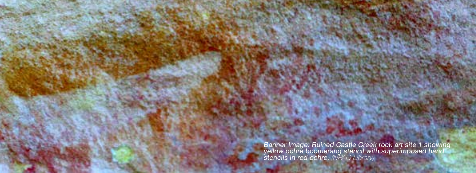
Banner Image: Ruined Castle Creek rock art site 1 showing yellow ochre boomerang stencil with superimposed hand stencils in red ochre.