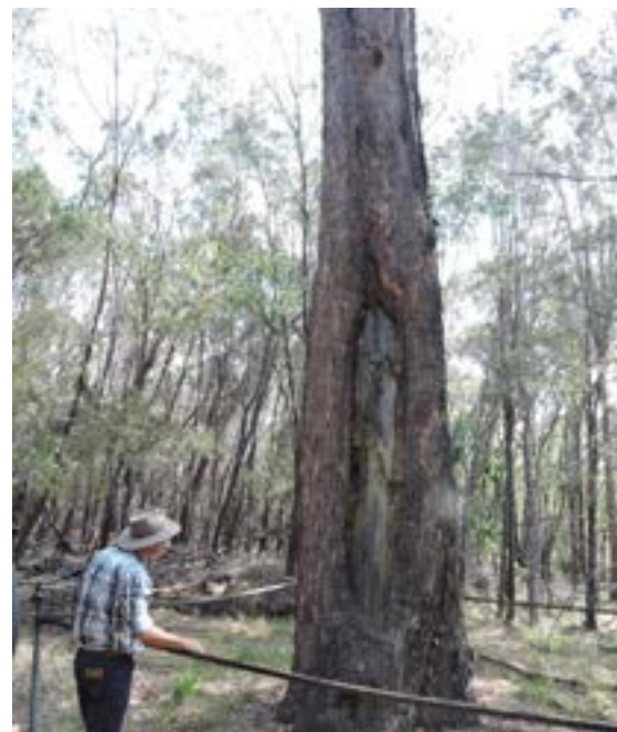
Scarred tree, Cleveland (G Siepen)

Scarred trees can tell us a lot about the history and development of an area. Firstly, scarred trees are a timely record